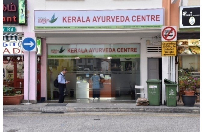
The ayurvedic centre which does not promote pañcakarma to avoid confusion