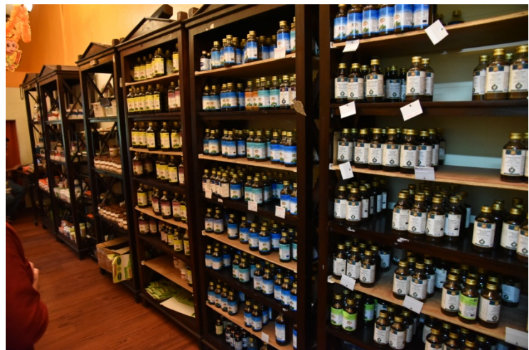
AVP remedies at Om Vedic Heritage Centre