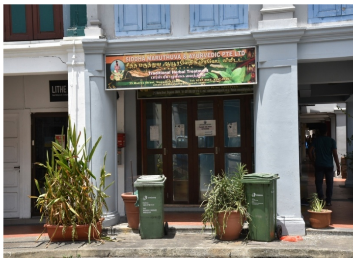
Siddha Maruthuva & Ayurvedic