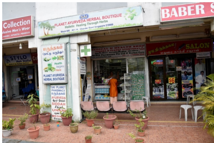
Orchid Pharmacare

pharmaceutical companies they come from, nor the process she is following to procure them. I could, nonetheless, identify remedies from two siddha companies: Annai Aravindh Herbals and Agasthiyar Herbal Products 30 whose packets of diverse curaṇam (powder of dried medicinal plant(s)) are displayed in front the pharmacy.