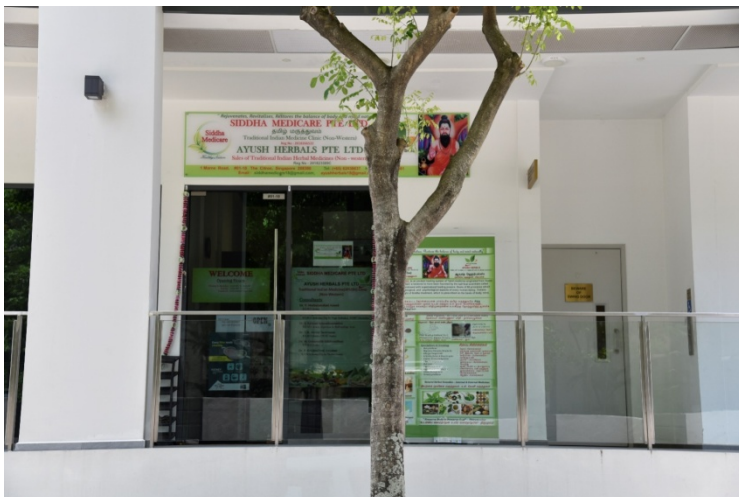
Siddha Medicare and Ayush Herbal

1957). Medicines provided in this clinic are, nonetheless, limited in variety. One of the doctors justifies this by the rigid rules regulating importation of remedies: for obtaining authorisation to import each product, a document providing information on the pharmaceutical company (address, GMP 28 and ISO certifications), list of ingredients, and medical uses, has to be sent to the Health Science Authority (HSA). Given that ayurveda clinics in Singapore regularly import drugs from India, obtaining authorisation to sell ayurvedic medicines is easier than siddha ones with which the HSA is less familiar. Patients may, nonetheless, complete their treatment by buying medicines in India, directly or through acquaintances (practice evocatively called "suitcase medicines"), or from some groceries and the pharmacy specialising in ayurveda, siddha and unani medicines, located in Little India.