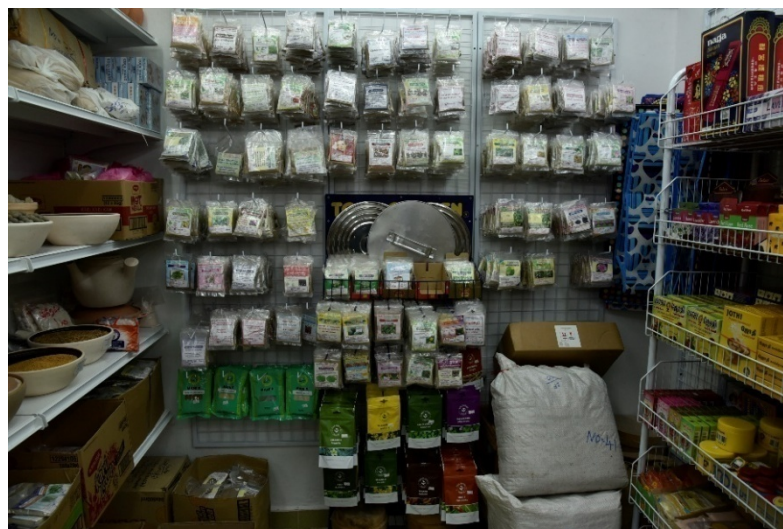
Display racks of Siddha remedies, herbals and articles for rituals at Shah's shop