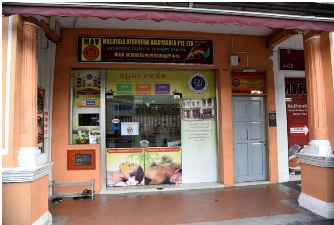
Malayala Ayurveda Vaidyasala