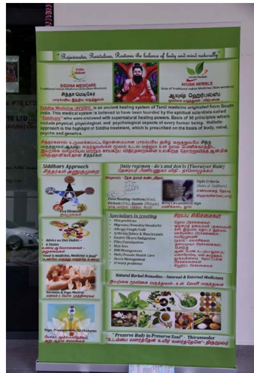
Poster of Siddha Medicare and Ayush Herbal ©Christian Sebastia

This pharmacy existed when Parvathy Vagadasalam conducted her fieldwork. Named Orchid Pharmacare, it was located in a rented building in the area where it is today, close to the heritage building of Tan Teng Niah on Kerbau Road. 29 Three main signboards, with diverse names for attracting a large variety of clients, are displayed in its front: 1/ Medical & Health Shop (siddha and planet ayurveda) & unani, Orchid pharmacare & herbal care; 2/ SAI Planet ayurveda herbal boutique, Holistic healing through herbs; and 3/ Maruntakam (Nāṭṭu Maruntu) meaning Pharmacy (Country Medicines). It is well known to Tamil people. The pharmacist, a Tamil woman, was reluctant to be interviewed and made me feel that I should not stay too long. I came back from time to time, but without finding out about the types of drugs she sells, the