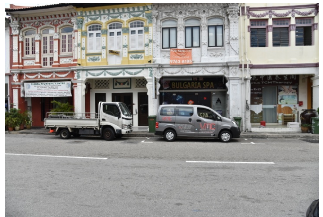
Practising ayurveda among multiple of wellness centres

Articles on the use of complementary and alternative medicines (CAM for Singapore) and of traditional and complementary (T/CM for Malaysia) in which TIMs are included, point out that they are sought especially for common ailments, disease prevention and wellness (Ang and Wilkinson 2013; Lim et al. 2005). The survey by Ang and Wilkinson (2013: 45), for example, reports, "the most common conditions clients came to see them [practitioners of CAM] were fatigue and lethargy (52%), musculoskeletal conditions (45%), chronic pain (41%), migraines and headaches (41%), and stress and anxiety (41%). More serious medical conditions such as arthritis (19%), cancer(19%), diabetes (10%), and heart disease (5%) were less frequently seen by the participants." However, in this survey, the practitioners' responses are not differentiated according to the CAM they are practising. The ayurvedic practitioners and doctors with whom I spoke, state that the health conditions for which they are approached vary from mild ailments, such as headache and joint pain, to lifestyle diseases (obesity and diabetes), and even to cancer. One doctor explains: