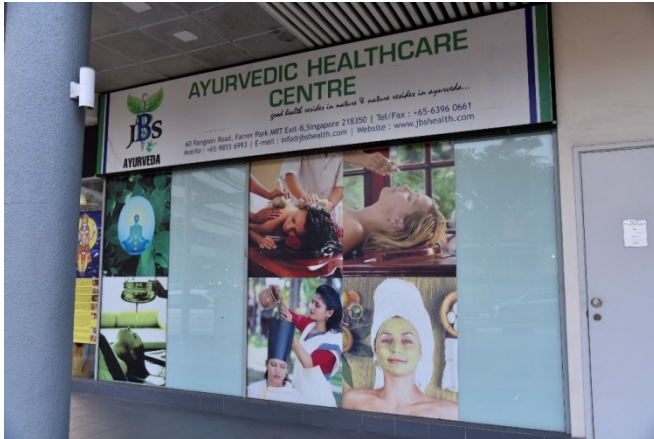
One of the ayurvedic centres promoting pañcakarma therapies