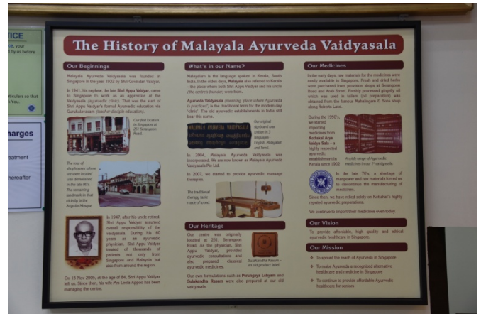
Malayala Ayurveda Sala: exhibiting medical heritage