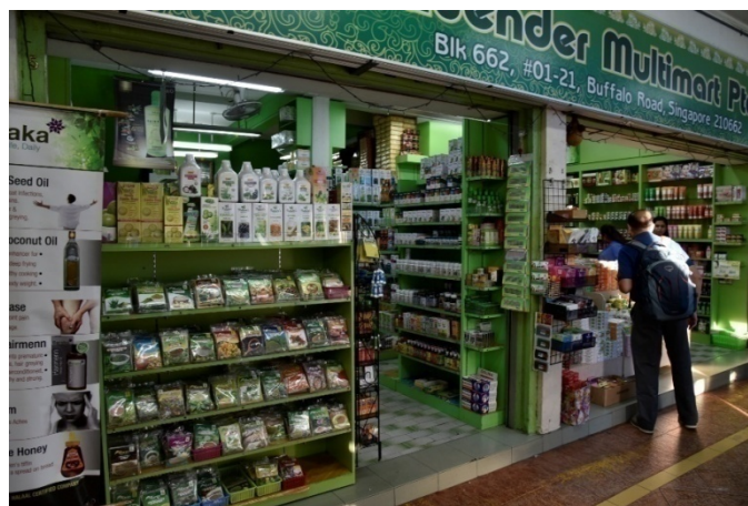
Lavender Multimart

Five or six Tamil groceries located in Little India sold medicinal herbal products: 31 curaṇam , in raw or capsule form, 32 decoctions and external oils. Sri Lavender Multimart, and Jothi stores (est.1962) are those that supply the greatest variety of brands of siddha (Allwin, 33 R.R Herbals, Annai Aravindh Herbals, SKM) and ayurvedic remedies (Himalaya, Dr Kumar's, Patanjali), and also some Chinese medicines, herbal and natural products (Killy, Nature's wellness, Svadeshi), dietary supplements and cosmetics.