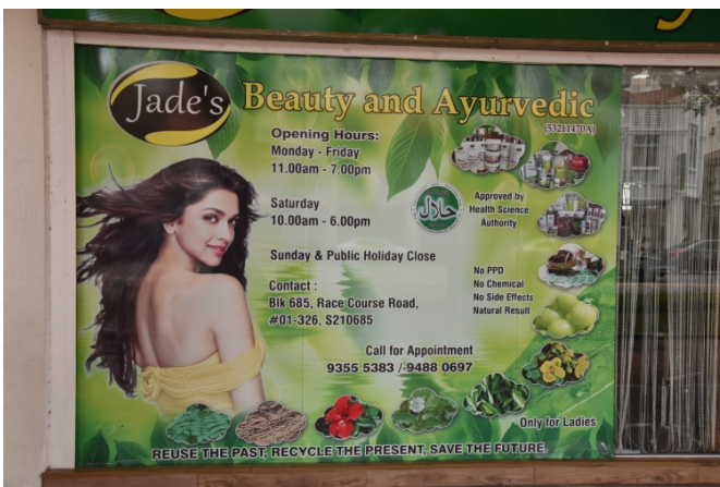
Indian beauty parlour