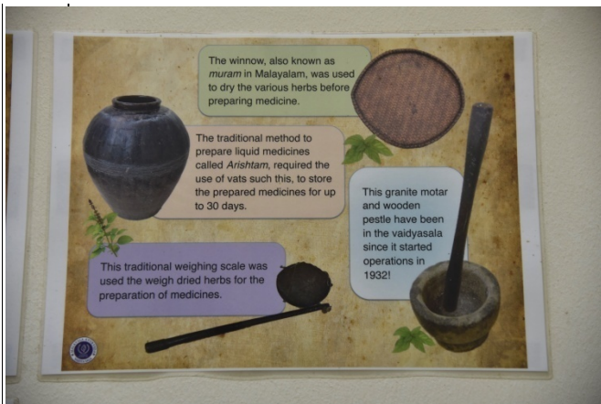
Malayala Ayurveda Sala: exhibiting medical heritage