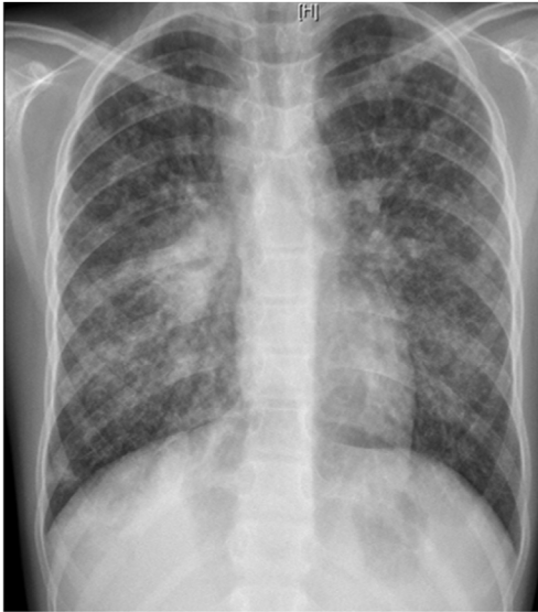
Fig. 2. Chest X-ray: diffuse alveolo-interstitial opacities, with right parahilar consolidation with central cavitation.