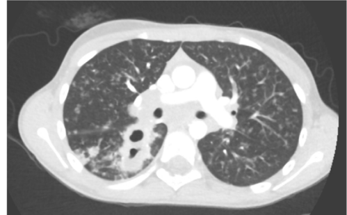
Fig. 3. Thoracic computed tomography: disseminated tuberculosis.

punctiform enhancement consistent with a right and left cerebellous granuloma, lumbar puncture was sterile, and neurological examination was normal with no cerebellous syndrome. Tuberculosis treatment was started with 2 months of quadritherapy: isoniazid–rifampicin–ethambutol and pyrazinamide, followed by 10 months of isoniazid and rifampicin (because of cerebral involvement). Azathioprine was temporarily suspended. The young patient was treated with corticosteroids (prednisolone 1 mg/kg/day 15 days, with progressive weaning) in prevention of immune reconstitution inflammatory syndrome, and because of bronchial obstruction. Enteral nutrition was added because of undernourishment. On follow up, apyrexia was prolonged, the cough disappeared and the patient gained weight. Chest X-ray after 1 month of treatment was back to normal.