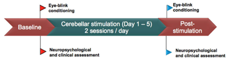
FIGURE 1 | Stimulation protocol and clinical assessment.

trigger any startle reflex nor any detectable reaction from the subject, thereby reducing the occurrence of alpha responses. The unconditioning stimulus (US) consisted of a 50 ms airpuff whose intensity (air pressure at the tip of the tube) was set to trigger painless eyeblink in 100% of the trials. Initially, the participant was exposed to five CS alone and to five US alone stimuli to establish appropriate responses to the tone and the airpuff as well as to measure the UR prior to conditioning. We also ensured that the US did not induce any startle reaction from the participant. A conditioning trial lasted 1 s and consisted of (successively): an initial 200 ms baseline period, a 400 ms CS that co-terminated with a 50 ms US, and a final 400 ms period during which the eyeblink was recorded. An EBC block consisted of 9 successive paired presentations of CS-US and a last trial with the CS alone. An EBC session consisted of 5 successive blocks separated by an inter-trial interval randomly ranging from 2 to 12 s. The participant was passively watching a silent movie during the task.