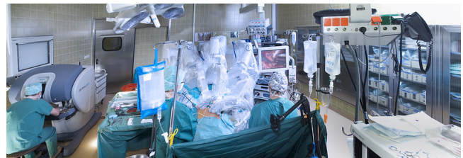
Figure 1: Da Vinci robotic surgical system.

The development of non-technical skills (NTS) is necessary for surgery to run smoothly, as technical skills alone are not sufficient to guarantee patient safety and positive outcomes. In surgery, a lack of communication and other NTS has been linked to a higher risk of surgical complications [29, 43]. Non-technical skills are composed of cognitive skills, social skills and operator's personal resources [2]. Cognitive skills includes decision making and situation awareness (SA). Social skills encompass communication, teamwork, and leadership. Personal resources refer to factors such as fatigue and stress [2]. According to Pradarelli et al., SA is considered as the most important of non-technical skills since other NTS are dependent on its development [29]. However, in dynamic and complex environments, such as in surgery, where large amounts of information is available and needed to perform the task, developing and maintaining SA is a particularly complex task [14].