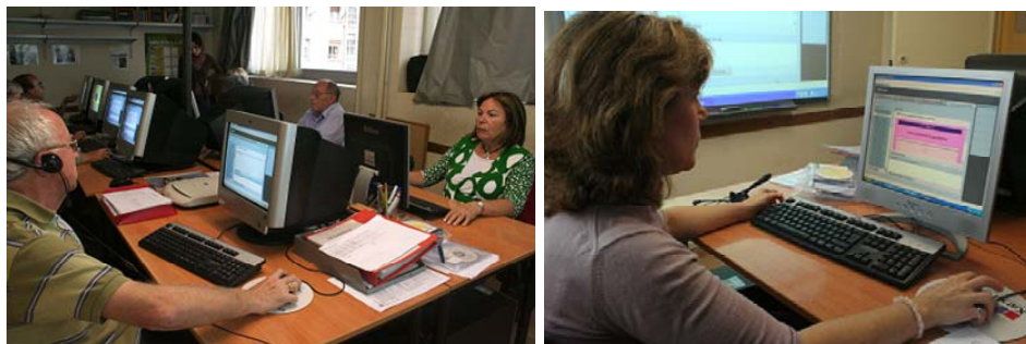
Figure 1. Participants using the TENCompetence tools in the Àgora computer room

The Àgora pilot took place mainly in the OMNIA computer room (see Figure 1) of the association equipped with 9 computers and was carried out between mid-September and the end of October. The computer room was reserved for using the TENCompetence infrastructure during 14 weekly hours. Participants had also the possibility to use the TENCompetence tools whenever the OMNIA was free, including the week-ends and after the end of the pilot. Besides, the participants also use the tool at home. The main aim of the pilot was to implement, test and investigate the benefits of the TENCompetence infrastructure and its support for the participants' competence development. The ten competence profiles from which participants could choose included ICT (MS Word, E-mail usage, Internet, MS Power Point, Windows management, Files management, Folders management, Blogs usage) and English language (basic and advanced levels) . For each competence, participants could choose between several activities, ranging from 3 to over 20 activities per competence. One activity stands for between 15 minutes and 3 hours of learning.