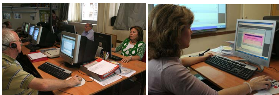
Figure 1. Participants using the TENCompetence tools in the Àgora computer room

The Àgora pilot took place mainly in the OMNIA computer room (see Figure 1) of the association equipped with 9 computers and was carried out between mid-September and the end of October. The computer room was reserved for using the TENCompetence infrastructure during 14 weekly hours. Participants had also the possibility to use the TENCompetence tools whenever the OMNIA was free, including the week-ends and after the end of the pilot. Besides, the participants also use the tool at home. The main aim of the pilot was to implement, test and investigate the benefits of the TENCompetence infrastructure and its support for the participants' competence development. The ten competence profiles from which participants could choose included ICT (MS Word, E-mail usage, Internet, MS Power Point, Windows management, Files management, Folders management, Blogs usage) and English language (basic and advanced levels) . For each competence, participants could choose between several activities, ranging from 3 to over 20 activities per competence. One activity stands for between 15 minutes and 3 hours of learning.