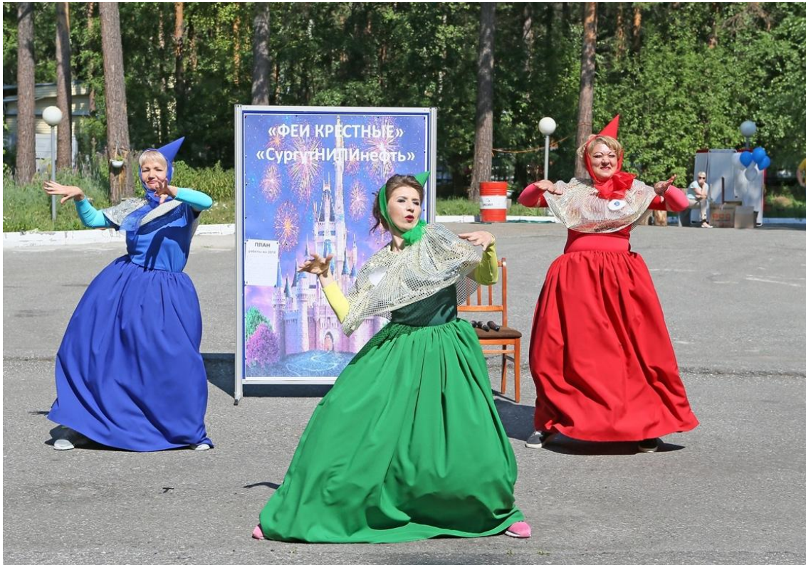
Figure 7. The Fairy Godmothers at the Festival “The Summer of the Council of Women,” Base of Mount Barsov, 2018. Source: Union of Russian Women, “Tvorcheskie otchety o dobrykh delakh,” October 2, 2018, http://wuor.ru/news?id=3274 .