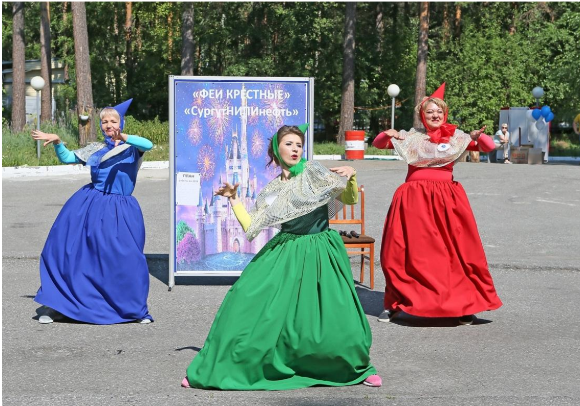
Figure 7. The Fairy Godmothers at the Festival “The Summer of the Council of Women,” Base of Mount Barsov, 2018. Source: Union of Russian Women, “Tvorcheskie otchety o dobrykh delakh,” October 2, 2018, http://wuor.ru/news?id=3274 .