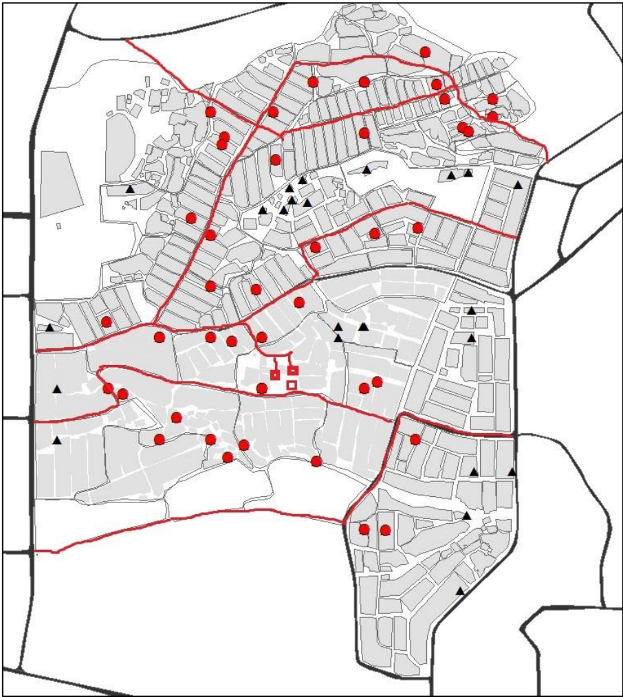
Map 1. Roadways built or improved by the IUDP and location of infrastructures

Note: The roadways built or improved are in red. The community centre, the health centre and the police station are shown as three squares in the neighbourhood centre. The dots represent the survey blocks close to the new roads. The triangles represent the survey blocks whose distance from the roads has remained unchanged by the IUDP.