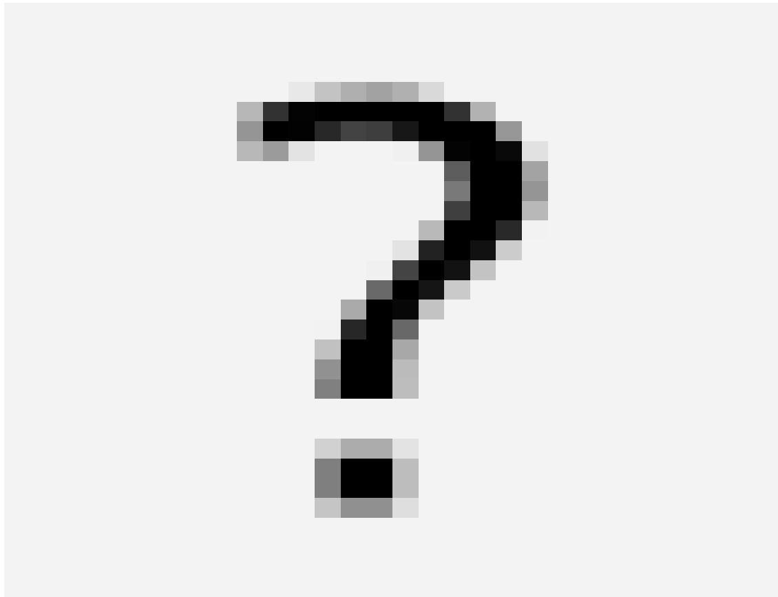
Figure 10: phylomemetic branch of quantum computing from the phylomemy reconstruction of the scope of FET Open projects between 1994 and 2007. Each square in the phylomemy is a set of terms defining a scientific field. As example, the details of fields 1 and 2 are given. Field that contain terms appearing for the first time in the phylomemy have a red header, those that contain terms not directly inherited from parent fields are have an orange header and fields that only contain terms borrowed to their parents are have a green header. This reconstruction highlights the reconfiguration of the fields around 2000 at a moment where two negative results have challenged mainstream approaches. We can clearly observe too phases of development involving many vocabulary innovations, with the pace of innovation slowing down in-between at a moment where major negative results where published.

The domain of quantum computing is particularly interesting from the point of view of phylomemy reconstruction for several reasons: