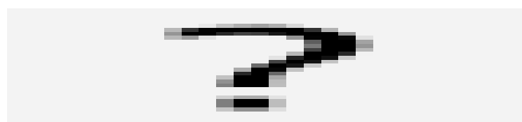
Figure 8: Workflow of phylomemy reconstruction from raw data to global patterns. The output is a set of phylomemetic branches where each node is constituted by a network of terms describing a research field. These nodes are a proxy of scientific fields and can have different statuses : emergent, branching, merging, declining.

To summarize, the workflow of phylomemy reconstruction starts from a large set of publications as the raw data and ends with the production of a structure characterizing the transformations of large scientific domains at a given spatio-temporal resolution (cf. Fig. 8). In between, it applies sophisticated methods of text-mining, co-occurrence indexation, transformations of temporal co-occurrence matrices into a proximity matrices and complex networks analysis on the resulting graphs (see Fig. 8). We invite the reader to refer to Chavalarias and Cointet (2013) and Chavalarias et al. (2020) for technical details.