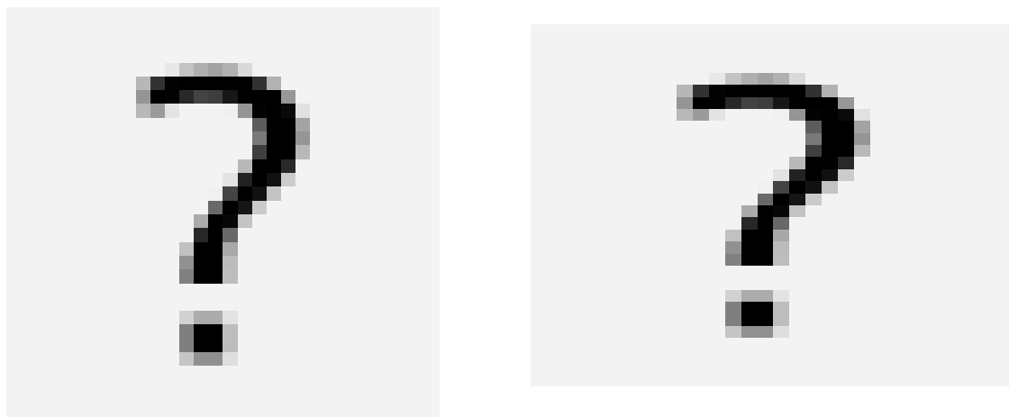
Figure 7 : Multi-level organization of phylomemetic networks. Left: from the micro-level of terms occurrences evolution to the evolution of the macro-level scientific fields, passing by the meso-level of keywords local networks describing some domain of interest. Right: the lineage of scientific fields arranged into phylomemetic branches. Each circle represents an element of the meso-level in the left part of the figure (a network of keywords computed over a given period that describes a scientific field). Vertical links between circles stand for conceptual kinship detection. Times flows top-down. The part of the branch highlighted by the caption is the domaine of rehabilitation engineering detailed in 5.3.

highlights how meso-level entities evolve through time at different scales of observation. The resulting multi-level organization this method defines (see Fig. 7) is a set of lineages of scientific fields arranged within phylomemetic branches. Each branch describes how fields of a given domain have strengthen, merged, split or weaken over time.