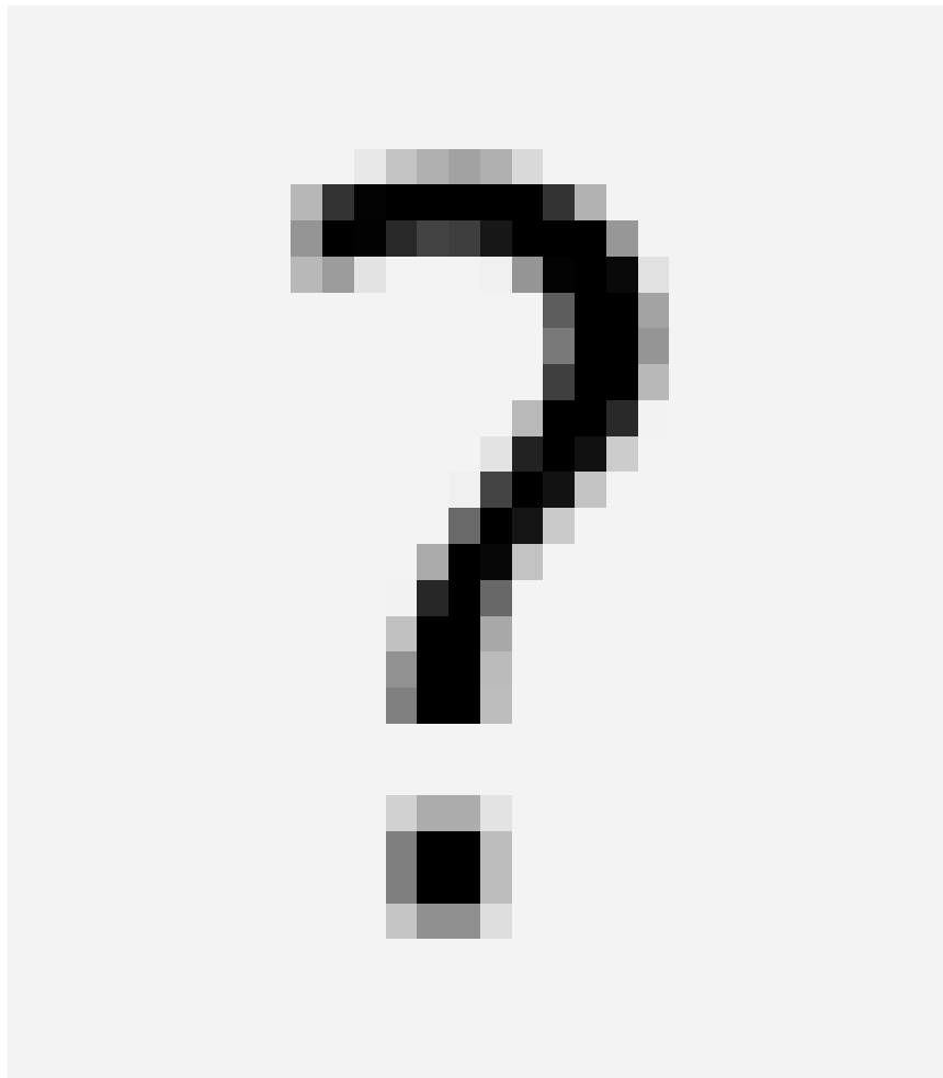
Figure 11: The phylomemetic branch of rehabilitation engineering . This branch has progressively evolved to incorporate the work in cognitive science on mirror neurons and brain-computer interfaces.

branch synthesize the main transformations of this field during 20 years of research.