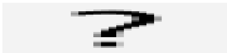
Figure 8: Workflow of phylomemy reconstruction from raw data to global patterns. The output is a set of phylomemetic branches where each node is constituted by a network of terms describing a research field. These nodes are a proxy of scientific fields and can have different statuses : emergent, branching, merging, declining.

To summarize, the workflow of phylomemy reconstruction starts from a large set of publications as the raw data and ends with the production of a structure characterizing the transformations of large scientific domains at a given spatio-temporal resolution (cf. Fig. 8). In between, it applies sophisticated methods of text-mining, co-occurrence indexation, transformations of temporal co-occurrence matrices into a proximity matrices and complex networks analysis on the resulting graphs (see Fig. 8). We invite the reader to refer to Chavalarias and Cointet (2013) and Chavalarias et al. (2020) for technical details.