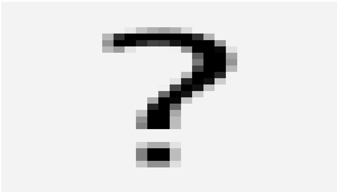
Figure 4 Articulation between phenomenological reconstruction and theoretical reconstruction . Phenomenological reconstruction provides both inspiration for new theoretical reconstructions and tests for existing competing theoretical reconstructions . Theoretical reconstruction provides some indication of the objects to be examined in phenomenological reconstruction and predicts some patterns that might be found in the latter.

On the other hand, when the challenge is to understand and model complex systems, intuition unaided cannot handle their intrinsic subtleties and non-intuitive properties. The task of finding a reasonably precise and concise approximation for the structure and behaviour of a phenomenon which can be grasped by the human mind is called phenomenological reconstruction . It is the process of pre-structuring data for a more comprehensive understanding in subsequent analyses. Ideally, phenomenological reconstruction may provide us with candidate concepts and relations, which, when integrated into a theoretical reconstruction, can then serve as a basis for the human experimental work (Bourgine et al. 2009).