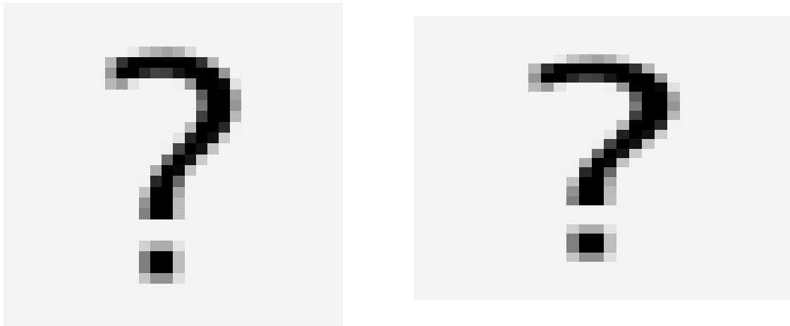
Figure 7 : Multi-level organization of phylomemetic networks. Left: from the micro-level of terms occurrences evolution to the evolution of the macro-level scientific fields, passing by the meso-level of keywords local networks describing some domain of interest. Right: the lineage of scientific fields arranged into phylomemetic branches. Each circle represents an element of the meso-level in the left part of the figure (a network of keywords computed over a given period that describes a scientific field). Vertical links between circles stand for conceptual kinship detection. Times flows top-down. The part of the branch highlighted by the caption is the domaine of rehabilitation engineering detailed in 5.3.

highlights how meso-level entities evolve through time at different scales of observation. The resulting multi-level organization this method defines (see Fig. 7) is a set of lineages of scientific fields arranged within phylomemetic branches. Each branch describes how fields of a given domain have strengthen, merged, split or weaken over time.