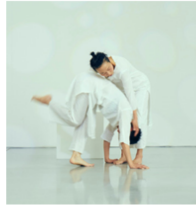
Figure 1. A contemporary dance and music improvisation centered around “MA”. This exploratory event took place in Kirishima Open Air Museum located in Kagoshima, Japan. Part of the performance (April 30, 2018) can be viewed at: https://youtu.be/17huFXOZFfo .