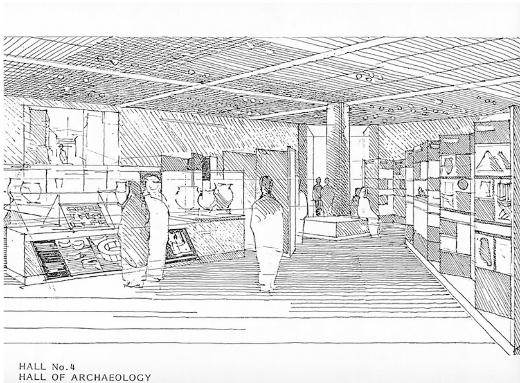
Figure 6 – Hall of Archaeology at the Bahrain National Museum. Original sketch by Thorkild Ebert

Notably, the museum's envisaged role transcends the preservation of the collections to building a sense of place. Eventually, and with the guidance of the International Council of Museums (ICOM), the organisational framework, mission, and programme directives were defined. The Bahrain National Museum channelled western practice and policies or, as Smith (2006) argues, an 'Authorised Heritage Discourse' that was defined by national and international agencies such as UNESCO and ICOM. However, despite the general operational guidelines, the close involvement of Bahraini stakeholders in the preparation, designing, and implementation of the architectural concept and the museum program, insured that the new museum meets the conservation and presentation requirements of the collections and responded to the needs of the local communities (Musameh, 1999: 61-70). More importantly, the Bahrain National Museum was managed and operated by an overwhelmingly Bahraini team, who either received training abroad or on the job, and insured that the museum meets global museum practice and fulfils its mission.