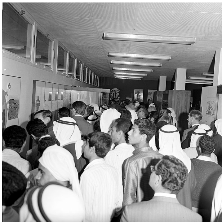
Figure 3 – Opening of Bahrain's first permanent display in Manama

The momentum and public interest garnered by the aforementioned archaeological display at Al-Hidaya Al-Khalifia School slightly waned as the Danish expedition did not keep up with presenting their results at the end of the following excavation seasons. However, the modernisation of the state of Bahrain in the late 1960s and early 1970s brought heritage discussions back to the fore. Given the small geographic area of Bahrain - roughly 700 km 2 - and the wealth and density of its archaeological heritage, some urban projects were halted by archaeological findings raising growing concerns among the local and the international community regarding the safeguarding of the heritage of Bahrain. This specificity galvanised a sense of national consciousness that was cultivated by international scholars working in Bahrain and supported by the Bahrain Historical and Archaeological Society 2 . As the Government of Bahrain was faced with the need to organise the rescue excavations, create a framework for the study of the excavated material, and the storage and public presentation of the recurrent new discoveries, a formal request was sent to UNESCO to seek professional assistance (Vine, 1993: 2).