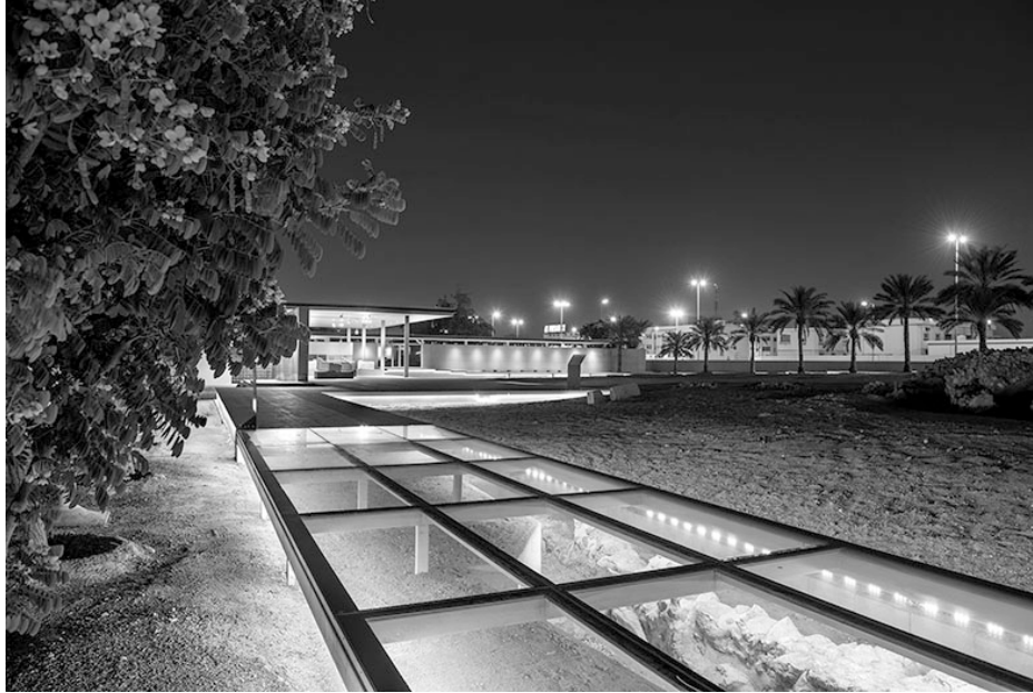
Figure 9 – Al-Khamis Visitors' Centre

At the time of writing, more site museums were slated for development such as the research centre and site museum at the archaeological site of Saar (designed by Tadao Ando Architect & Associates), the site museum at the A'ali Burial Mounds (designed by Wohlert Arkitekter) and the site museum at the site of Barbar (designed by Basmaji & Bielinska Architects). In addition, further developments within the museum sector include the planned Contemporary Art Museum (designed by Zaha Hadid) and the Children's Museum (designed by Fares & Fares) (Bahrain Authority for Culture & Antiquities, 2016). The initial architectural designs for the above mentioned museum projects were prepared in the years between 2006 and 2010 (Bahrain Authority for Culture & Antiquities, 2015). The projects have not been executed yet due to lack of funding.