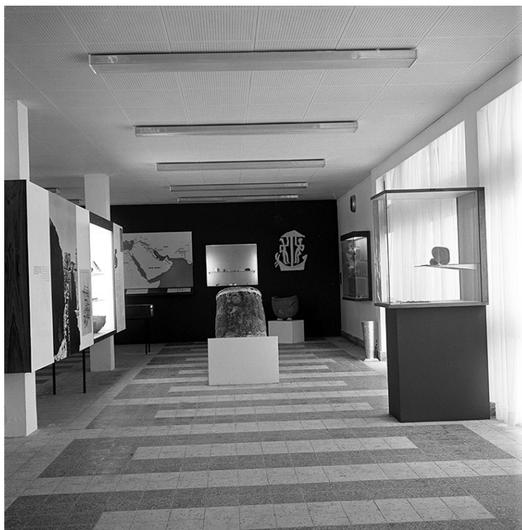
Figure 4 – Bahrain's first permanent display designed by M. Rice

preservation in Bahrain. In 1969, the first Bahraini team of excavators was formed and in 1970 the first 'Law of Archaeology' was implemented. Thereafter, the Government of Bahrain sought the scientific guidance of archaeologist G. Bibby to prepare a display at the Government House in Manama. Eventually, Bahrain's first permanent exhibition, designed by architect M. Rice, was opened in March 1970 to coincide with the hosting of the Third International Conference of Asian Archaeology in Bahrain (Figures 3 and 4). In addition, the government allocated significant budgets for the preservation of archaeological sites, the restoration of historic houses, the hosting of international conferences, and for academic research (Al-Khalifa and Rice, 1986: 10-14). This cultural investment at the time was a momentous step aimed at enhancing the image of Bahrain as a civilized and modern nation-state and, consequently, boosting its potential to become a main touristic destination in the region.