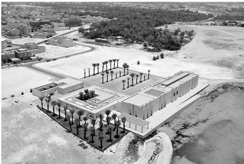
Figure 8 – Qal'at al-Bahrain Site Museum