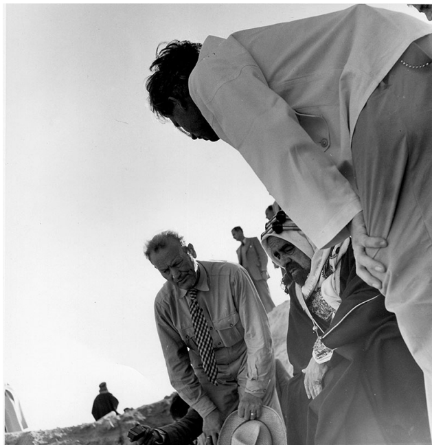
Figure 2 – Shaikh Salman bin Hamad Al-Khalifa visiting the Danish archaeological excavations