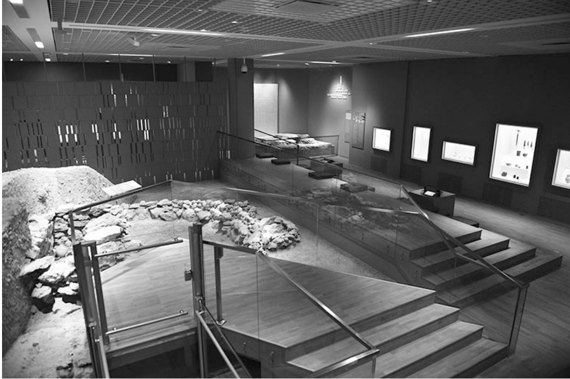
Figure 10 – The remodelled Hall of Dilmun Graves at the Bahrain National Museum