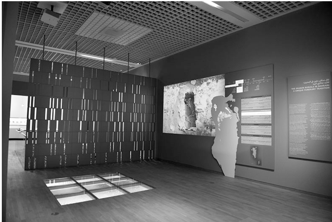
Figure 11 – The remodelled Hall of Graves opened to the public in June 2019