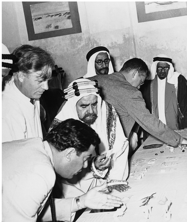
Figure 1 – Shaikh Salman bin Hamad Al-Khalifa visiting the display at Al-Hidaya Al-Khalifa School

Bahrain. The Late Amir Shaikh Salman Bin Hamad Al-Khalifa was a strong advocate of heritage preservation and one of the main sponsors of the excavations (Figures 1 and 2).