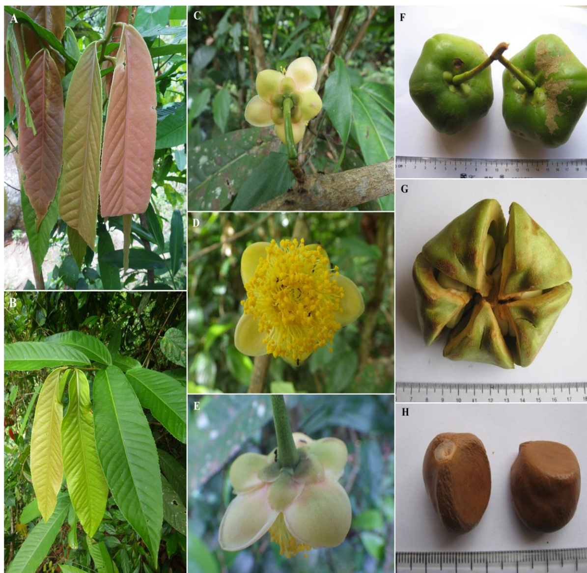
FIGURE 1. Camellia proensis. A, B. Young twig. C, E. Flowering shoot and arrangement of petals. D. Open flower. F, G. Fruits. H. Seeds.