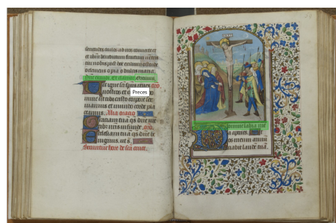
(b) Manual annotation (in green) of sections (in tooltip "Preces")