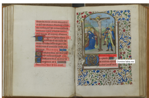
(a) Line detection (in red) and automated HTR (in tooltip "Domine labia me")