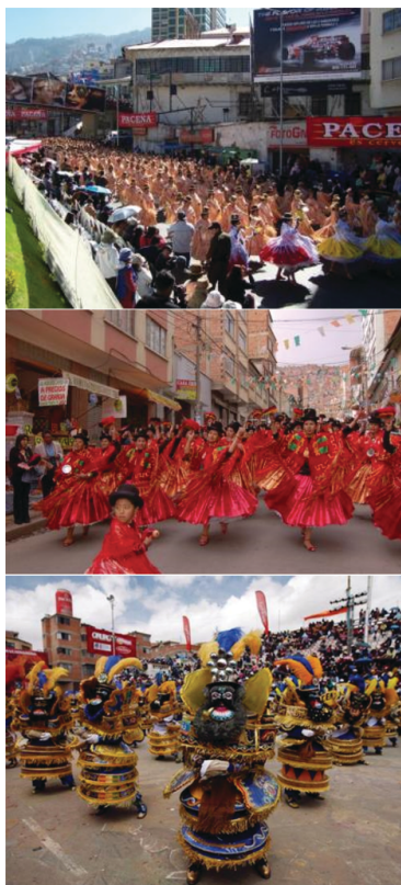
Figure 3 Parades and carnivals feature the different colors of the fraternities of the cholos elites

To return to the use of public space in El Alto, the most visible expression of corporations among local elites are parades and carnivals (see Figure 3) that take place regularly on the streets of the city (Harris, 1995; Guss, 2008; Hempele, 2008). Each group that participates in a parade is financed by a pasante (sponsor), who belongs to a fraternity whose colors feature in the participants’ costumes (Albó and Preiswerk, 1991). Chalets constitute another manifestation of this affirmation of collective corporate identity in the city. Through the buildings and their material and symbolic—or economic and aesthetic—dimensions, the elites of the ethnic economy located in El Alto compete for the use of public space with local economic rivals. They compete in the streets by funding the most magnificent parade and producing the most visible—and original— chalet .