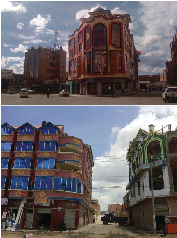
Figure 1 Two chalets in El Alto, with shops and workshops at the lower levels (photos by the author, 2010)

This essay analyzes the chalets as architectural forms embedded within an economy of symbolic goods characterized by a ‘dual truth’ (Bourdieu, [1997] 2000): they are at once material and symbolic, performing an economic function while at the same time seeking conspicuous exposure and public visibility. The point here is to not explain this kind of Andean house as a ‘cosmos’ (Arnold, 1995) by showing how its internal organization reflects a specific vision of natural and social order, based on Bourdieu’s early classic study of ‘The Kabyle house, or the world reversed’ from a structuralist perspective (Bourdieu, [1970] 1990). On the contrary, I emphasize the ‘external’ or public dimension of this novel architectural design (visibility aspects and aesthetic ornamentations). The chalets represent an obvious demonstration of social and economic power, and their prominent location on the streets and at major crossroads signals the eminence of a specific El Alto social group: a group of successful indigenous entrepreneurs in commerce, transportation or the textile industry—sectors that still account for an important part of the Bolivian economy (35% in the 2000s). The owners of these outlandish houses run family businesses that are deeply enmeshed in the international economy via imports from Brazil, Chile, Peru, the United States or China.