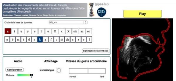
Figure 2 The Ultraspeech-player software [4].

The patient performed 11 sessions (3 sessions/week, 30min/session), in addition to conventional SLT.