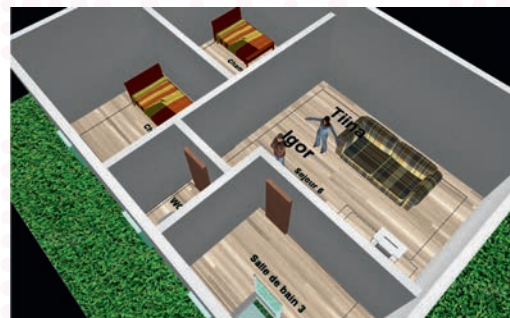
◀ Screenshot of a simulation concerning indoor air quality generated using GAMA.