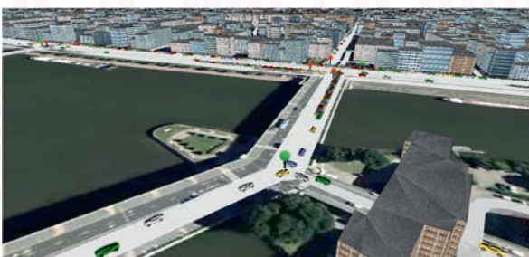
▲ Screenshot of a road traffic simulation for the French city of Rouen generated using GAMA.

For further information: http://gama-platform.org