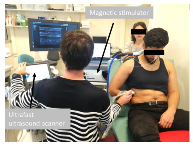
Fig. 2: Experimental setup. The subject is equipped with an esophageal and gastric balloon while being cervical magnetic stimulation is delivered on the optimal simulation spot. An ultrafast ultrasound scanner (Aixplorer, Supersonic Imagine, France) is used to image the zone of apposition of the right

Because of non-normality, Friedman repeated measures ANOVA were used to evaluate the effect of stimulation intensity of Pdi_{tw} and Vdi_{max} . Tukey's post-hoc were performed if a significant main effect of intensity was found. Spearman ( \rho ) correlation coefficients were calculated to analyze within-individual relationships between the variables. Overall relationships were assessed using repeated measures correlations (R, [12]). Finally, absolute and relative within-day reliability of Pdi_{tw} and Vdi_{max} were assessed using standard error of measurement (SEM) and intraclass correlation coefficients (ICC), respectively.