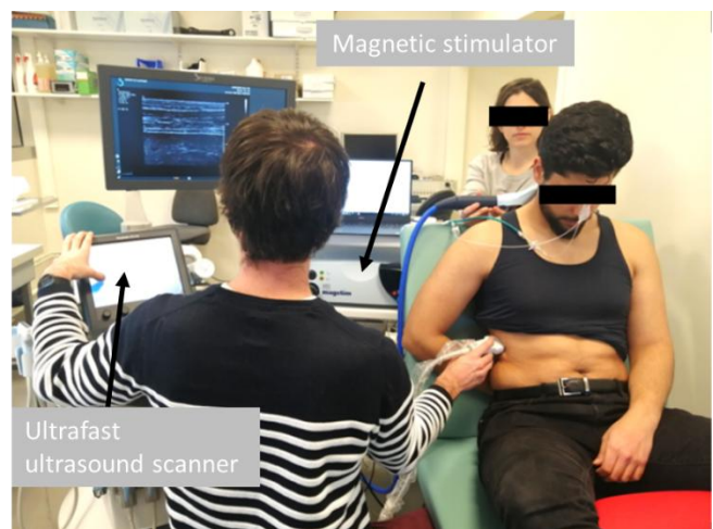
Fig. 2: Experimental setup. The subject is equipped with an esophageal and gastric balloon while being cervical magnetic stimulation is delivered on the optimal stimulation spot. An ultrafast ultrasound scanner (Aixplorer, Supersonic Imagine, France) is used to image the zone of apposition of the right hemidiaphragm.

Because of non-normality, Friedman repeated measures ANOVA were used to evaluate the effect of stimulation intensity of Pdi tw and Vdi max . Tukey's post-hoc were performed if a significant main effect of intensity was found. Spearman (ρ) correlation coefficients were calculated to analyze within-individual relationships between the variables. Overall relationships were assessed using repeated measures correlations (R, [12]). Finally, absolute and relative within-day reliability of Pdi tw and Vdi max were assessed using standard error of measurement (SEM) and intraclass correlation coefficients (ICC), respectively.