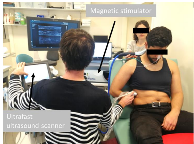
Fig. 2: Experimental setup. The subject is equipped with an esophageal and gastric balloon while being cervical magnetic stimulation is delivered on the optimal stimulation spot. An ultrafast ultrasound scanner (Aixplorer, Supersonic Imagine, France) is used to image the zone of apposition of the right hemidiaphragm.

Because of non-normality, Friedman repeated measures ANOVA were used to evaluate the effect of stimulation intensity of Pdi tw and Vdi max . Tukey's post-hoc were performed if a significant main effect of intensity was found. Spearman (ρ) correlation coefficients were calculated to analyze within-individual relationships between the variables. Overall relationships were assessed using repeated measures correlations (R, [12]). Finally, absolute and relative within-day reliability of Pdi tw and Vdi max were assessed using standard error of measurement (SEM) and intraclass correlation coefficients (ICC), respectively.