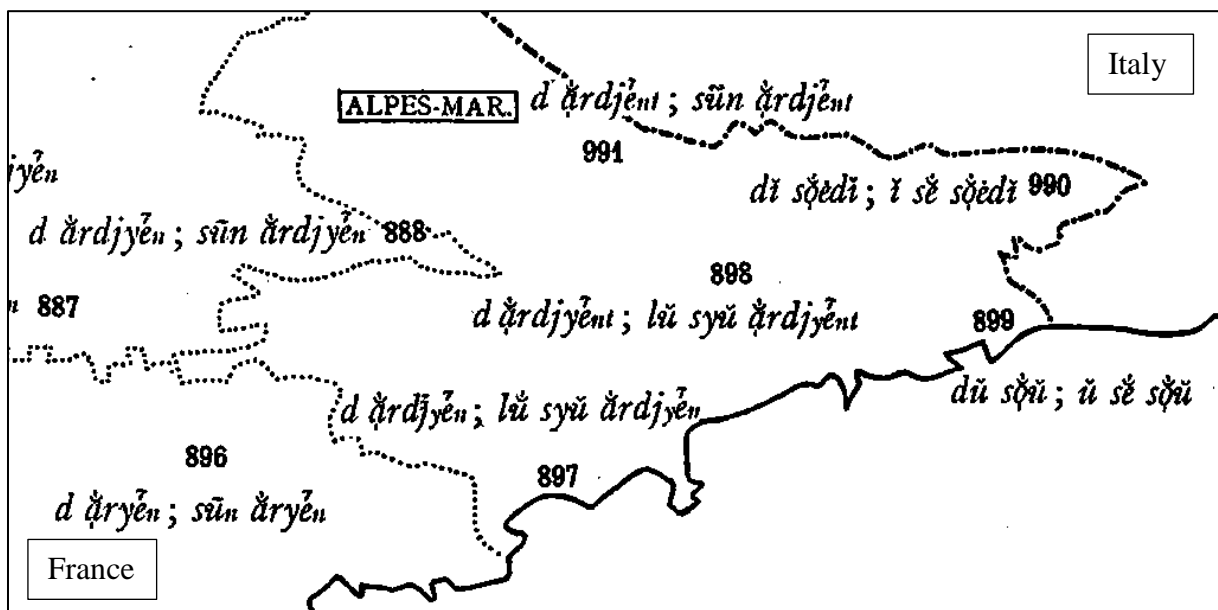
Fig 2 – ALF 57: ( gagner ) de l'argent ; (... et que nous lui rendions ) son argent

According to the ALF data, singular mass nouns are introduced by de (without article) in the other southern Occitan dialects, including those spoken in Plan-du-Var (898), which is located at the western border of the area we are examining, and Le Cannet (897). Conversely, the Ligurian dialect of Fontan (990), and the “transitional” dialect of Menton (899) differ from southern Occitan varieties in requiring the definite article after de :