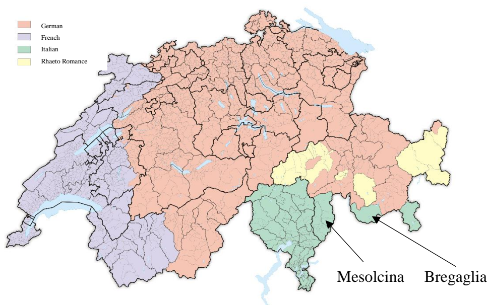
Fig. 1 – Linguistic areas of Switzerland (2017)

belong to the canton of Grisons, the two valleys are separated by orographic, linguistic, and administrative barriers (Grassi 2008). 1