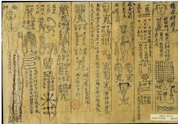
Fig. 3 : Manual of talismans for the household's protection Dunhuang, tenth century, P. 3358

Another example, discovered at Cave 17 in Dunhuang, is a tenth-century Buddhist dhâranî-talisman with polychromatic images of astrological deities (Stein painting 170). Dunhuang collections have also preserved talismanic rituals issued by officials expert in mantic techniques or by military officers of the region, as well as some catalogues of fu produced by local diviners. The tenth-century manual Pelliot 3358, for example, contains a series of about twenty models for talismans, sometimes accompanied with instructions concerning their fabrication and function. These talismans are intended to protect the family against domestic problems such as disease, familial conflict, poor harvests, infertility, and nightmares (fig. 2).