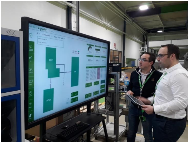
Fig. 3. Schneider Factory of the Future, Vaudreuil [28]

Industry 4.0 implemented the principle of collaboration human-machine in co-bots [26] and some factories of the future, such as those of Schneider Electric in Vaudreuil. AI powers the cyber physical systems and digital twins [27].