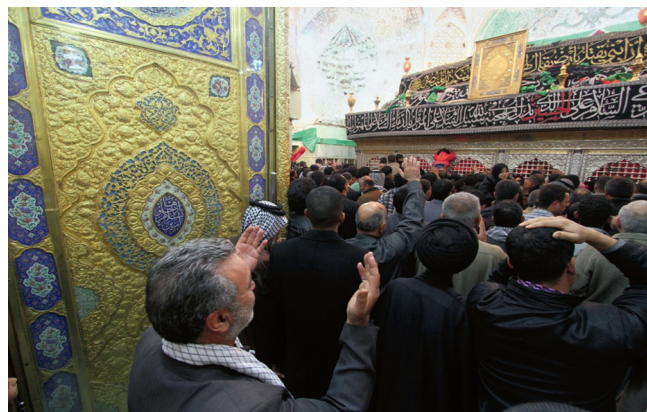
FIGURE 12 Interior of Imam Ḥusayn's shrine in Karbala

is the first place where God was worshipped. And when God asked the angels to bow down before Adam, that is where they did it.” 46