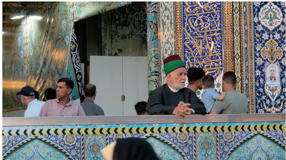
FIGURE 11 A khādem of Imam Ḥusayn's shrine © S. PARSAPAJOUH, SUMMER 2018