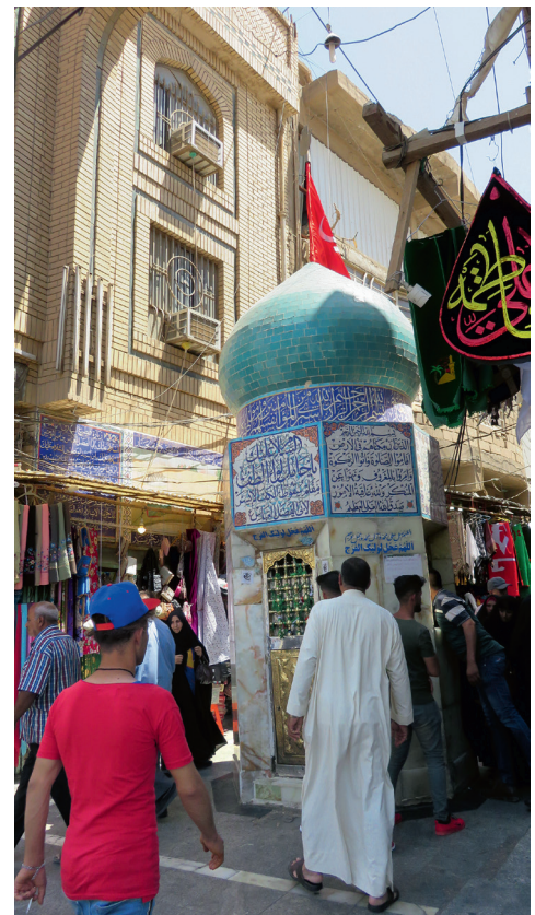
FIGURES 8 AND 9 The maqām of 'Abbās' left hand, in Karbala © S. PARSAPAJOUH, SUMMER 2018