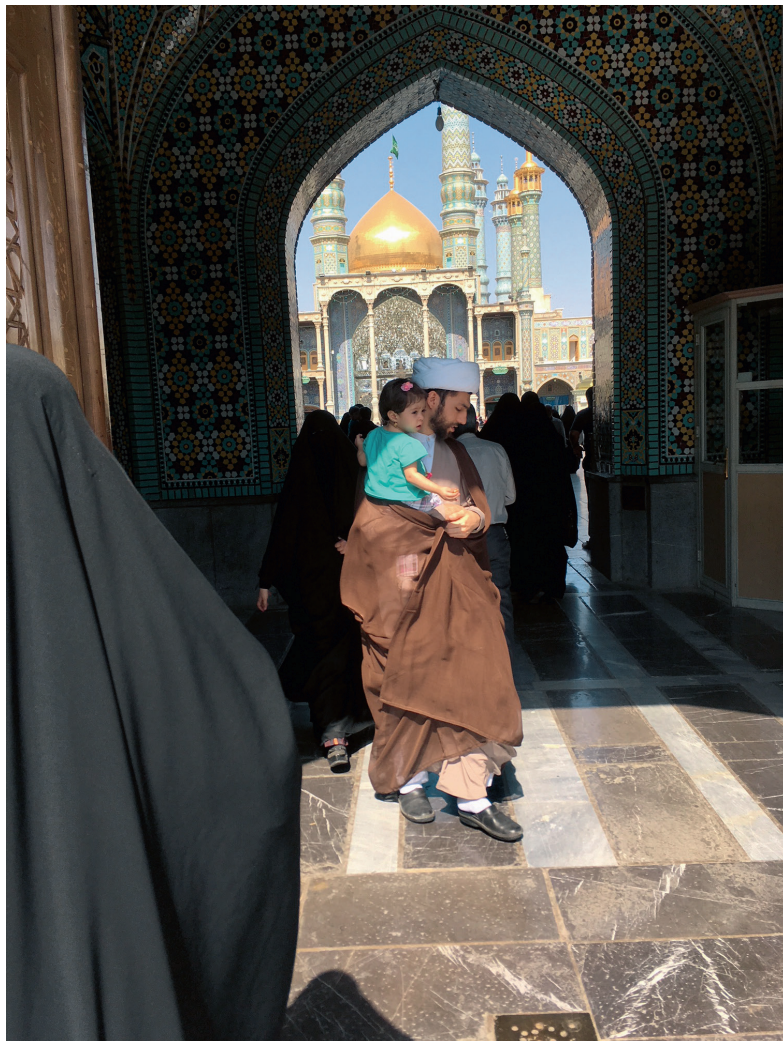
FIGURES 1 AND 2 The shrine of Fāṭima al-Ma'ṣuma in Qom