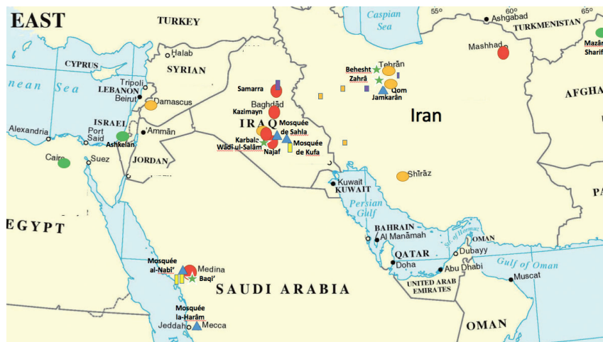
FIGURE 5 Map of sacred places in Afghanistan, Iran, Iraq, Arabia, Syria, and Egypte