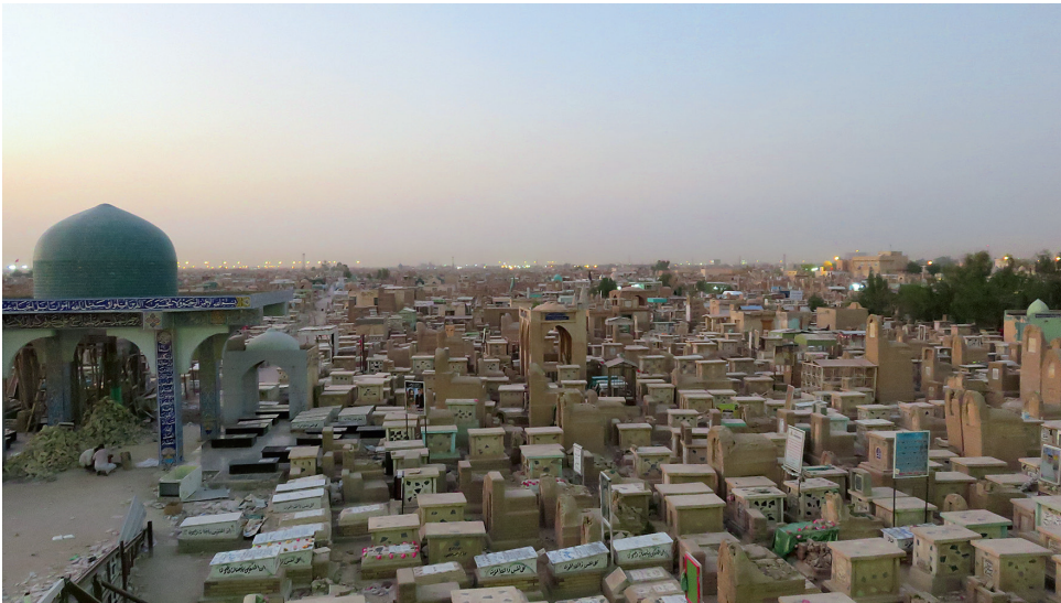
FIGURE 13 Wādi al-Salām cemetery