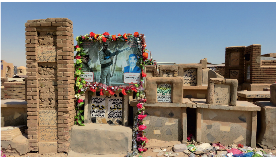
FIGURE 15 Example of the martyrs' tombs in Wādi al-Salām © S. PARSAPAJOUH, SUMMER 2018