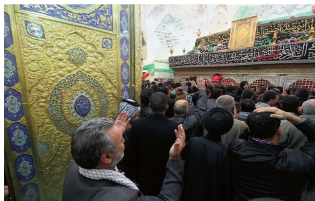
FIGURE 12 Interior of Imam Ḥusayn's shrine in Karbala

is the first place where God was worshipped. And when God asked the angels to bow down before Adam, that is where they did it.” 46