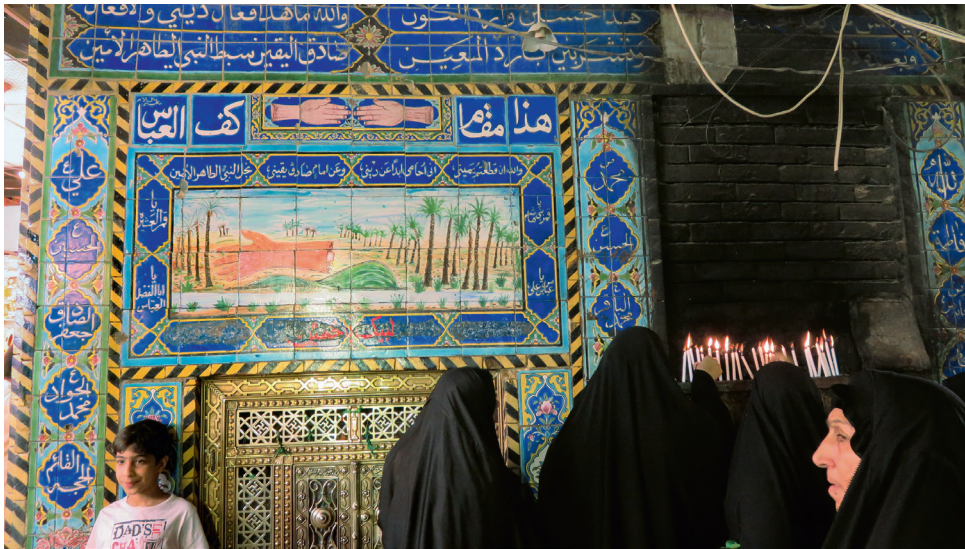
FIGURE 10 The maqām of 'Abbās' right hand, in Karbala © S. PARSAPAJOUH, SUMMER 2018

(fig. 8–10). His head, according to some accounts, is also buried elsewhere, much further away in the cemetery of Bāb al-Ṣaghīr of Damascus, next to the heads of other martyrs of Karbala, in a mausoleum that we discussed earlier.