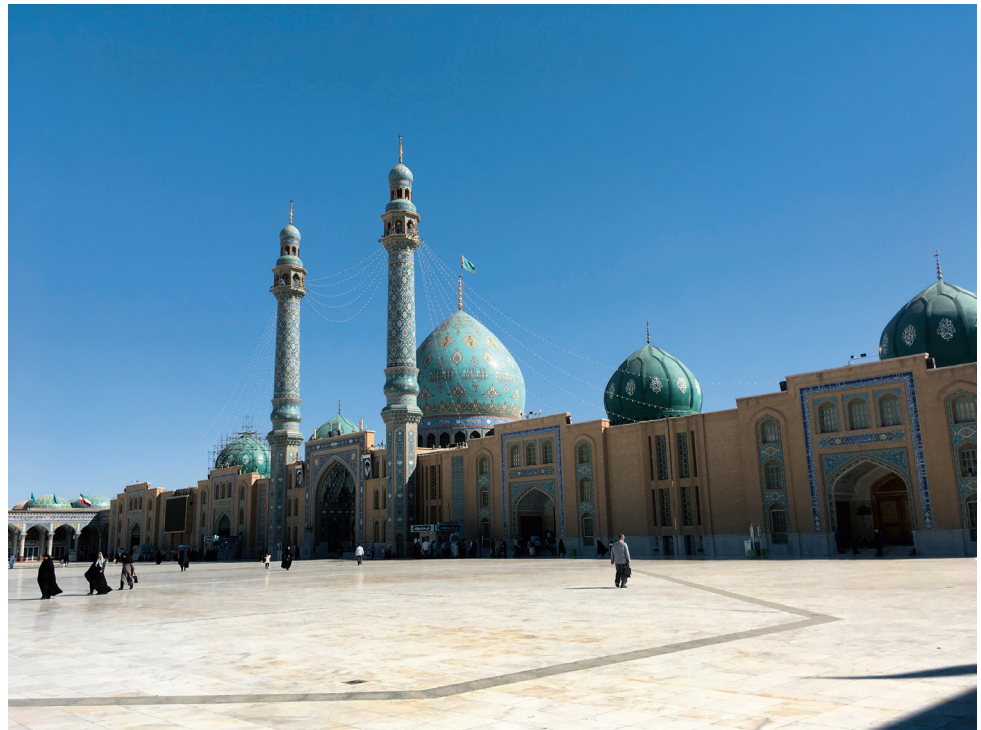
FIGURE 17 Mosque of Kamkarān