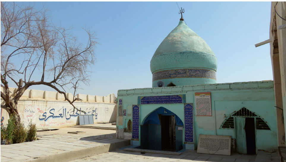
FIGURE 14 Maqām of Mahdi in Wādi al-Salām © S. PARSAPAJOUH, SUMMER 2018