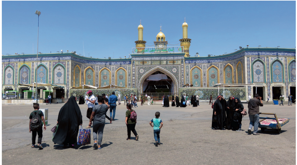
FIGURE 7 The Shrine of 'Abbās in Karbala

The body of Ḥusayn's half-brother, Abū l-Faḏl al-'Abbās, rests in Karbala in a shrine (fig. 7), 300 meters away from the Ḥusayn shrine, while his severed hands are located in two other burial sites in Karbala. These places are called maqām , one for his right hand, and the other for his left hand, and they are far removed from each other and can be found in the alleys of the old urban construction around the two sanctuaries