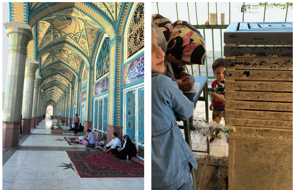
FIGURES 18 AND 19 Jamkarān Mosque: on the left: the space outside the sacred monument, inside the courtyard; on the right, the famous ex-voto well located behind the main mosque