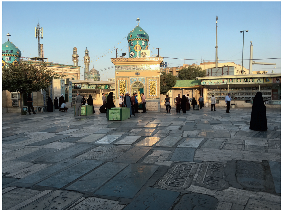
FIGURE 16 A part of the Shaykhān cemetery in Qom

not only crowds of the living – nearly 20 million pilgrims a year – but also crowds of the dead. Countless pious Shi'a request a resting place within the enclosure of the mausoleum, in the courtyard, or further inside the city, to be wrapped in the grace of Fāṭima al-Ma'ṣūma as they enter the afterlife, protected by her intercession on the Day of Resurrection. 49 The territory of Qom is therefore that of tombs and cemeteries. It was already so before it became a real urban center. As in Najaf, the sacredness of this area has attracted the bodies of the most pious Shi'a since the first centuries of Islam. In the oldest images of the city (sketches, paintings and photographs) the number of graves alongside the mausoleums is striking. According to travel accounts, this landscape lined with tombs was most impressive in the eyes of westerners. Today, it is impossible to tell if it is the sacredness of the city that makes the cemeteries sacred, or the sacredness of the cemeteries and tombs that makes the city holy.