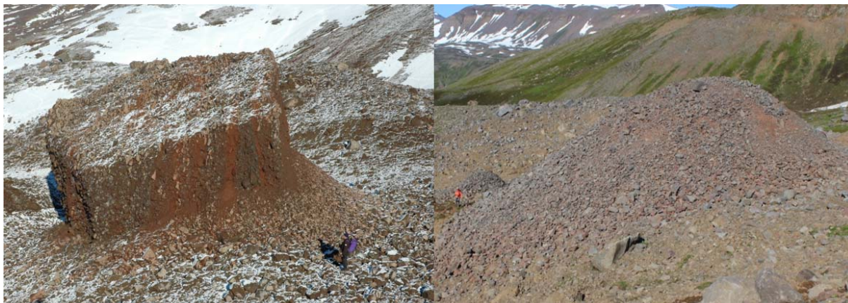
Figure 1: Formation of a molard in the Móafellshyrna landslide, 2012. Left frozen block and right, cone shaped molard.

Conical mounds are found around the Caloris Basin on Mercury. We mapped their locations and found that their distribution is consistent with them being part of the Caloris ejecta blanket. Their shape and the fact that debris from their flanks buries surrounding materials (Figure 2) suggests they continued to evolve long after the basin was formed. Because their