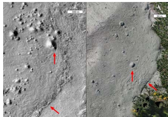
Figure 4: Comparison between candidate molards in Hale crater ejecta, left and molards in Mount Meager, right.