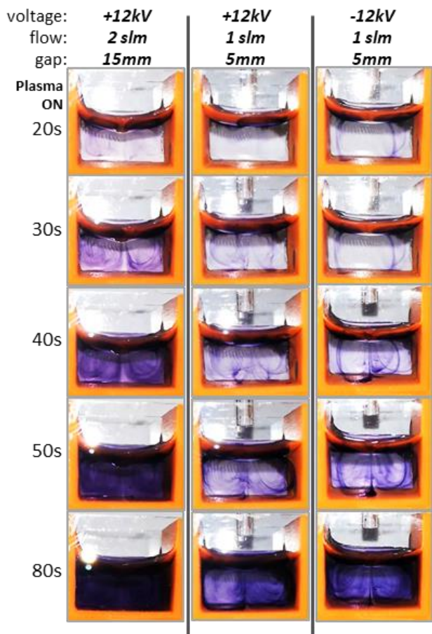
Figure 3: Temporal evolution of target solution containing KI-starch reagents during plasma exposure for different operating conditions

close to the vessel wall and a central column in correspondence of the impinging point. The volume of liquid at the centre of this vortices forms a torus that remains relatively clear of plasma induced reactive species up to 80s after the start of the plasma.