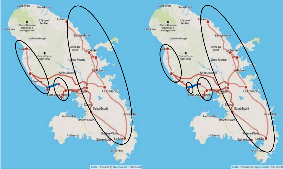
Figure 4: Proposed zonal configurations. The bottleneck is shown in blue.