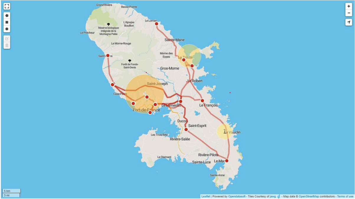
Figure 3: HTB power network in Martinique