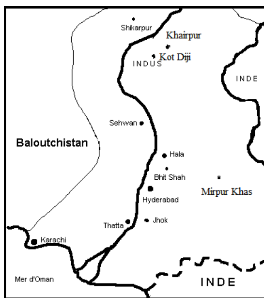
Fig.3 Sindh showing the main places mentioned