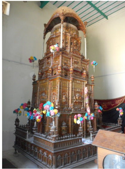
Fig.4 A ta'zīa kept by the Ṭalpūrs in Kot Diji, late 18th or early 19th century

sacrificing lover is henna for the beloved's hands!