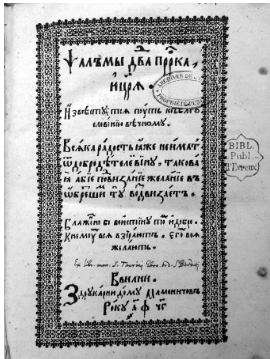
Fig. 1: the first page of the psalter. Bibliothèque-médiathèque Rolland-Plaisance d'Évreux, fonds patrimonial, Ms. Etr. 3.

Greek, Ruthenian and Slavonic books and to sell them freely throughout the Polish-Lithuanian Commonwealth 24 . The sovereign's support enabled the Mamonicz family to rise to the position of the major printers in the Lithuanian capital with, during some periods, a situation of almost exclusive position regarding Cyrillic texts in Slavonic and Ruthenian. In the same year, they also published their first edition of the psalter with a supplement 25 . The text was the subject of two new editions in 1591 and in 1593, the last corresponding to the copy kept in Évreux 26 .