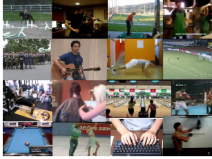
Fig. 2. Sample of classes from UCF-101 dataset. From top-left to bottom-right, classes are: riding horse, playing violin, golf swing, pizza tossing, military parade, playing guitar, pushups, soccer penalty, bench press, haircut, bowling, punch, billiard, ice-dancing, typing.