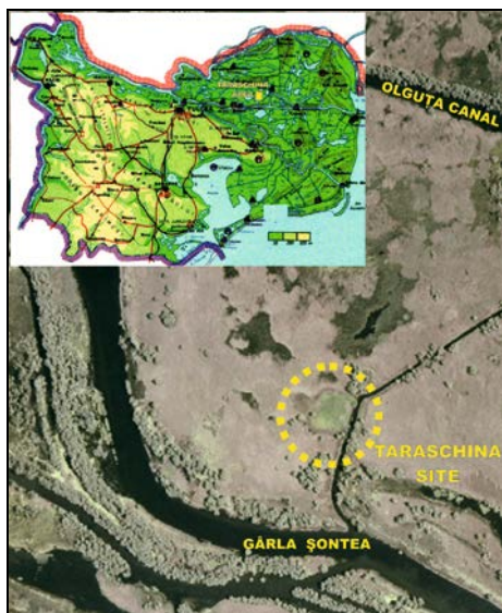
Fig.1 Map of Tulcea County and the location of Taraschina site within the Danube Delta

Neolithic - Eneolithic (end of 6 th ÷ start of 4 th Mil. BC) settlements belonging to Hamangia, Boian and Gumelnița cultures, all revealing at least one habitation level, have been discovered in many Northern Dobrogea sites located on terraces, cliffs and promontories of the paleo-seashore, today the western border of the delta plain (Istria, Baia, Ceamurlia, Lunca, Enisala, Sarichioi, Nufăru, Mahmudia, etc.) and, within the plain, on higher ground (Popina Is., Taraschina Mound).