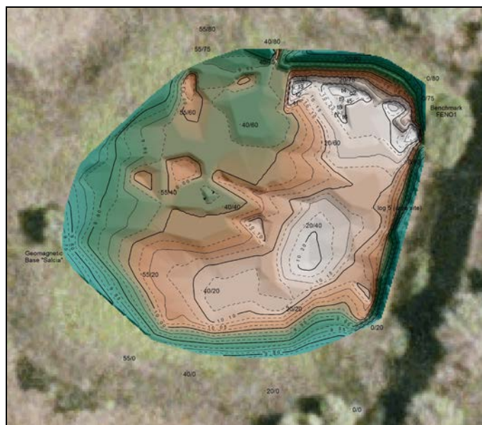
Fig. 2 Elevation model of central part of Taraschina site (altitudes are relative to a local altimetry system)

The mound shape of the site has been confirmed by the topographic mapping, the total variation of the ground level being of around only 55 cm. The gentle relief of the surface (Fig. 2), which nowadays is almost flat, is due to alluvial burial of the mound, which in Prehistory time was