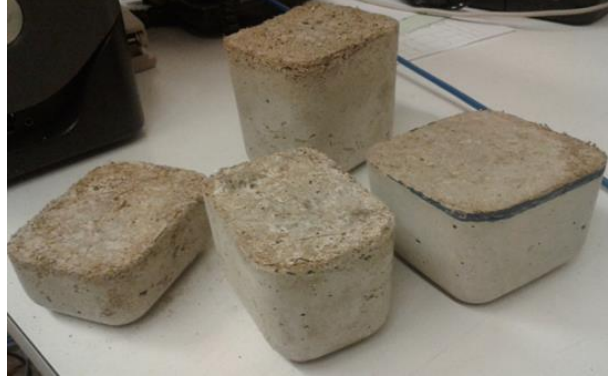
Figure 1: samples testing