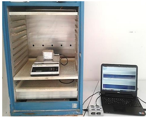
Figure 2: Experimental device used to evaluate moisture buffering of PDC .

To characterize the ability of the PDC to buffering (store and release) the moisture of the surrounding air; the method defined by the Nordest project [3] was used. This protocol consists to expose the sample to constant temperature with a cyclic variation of RH between high (75%) and low (33%) values for 8 and 16 hours respectively. In this paper, we have used a protocol for two different temperatures (23°C and 10°C) in order to study the effect of temperature on the PDC moisture buffer.