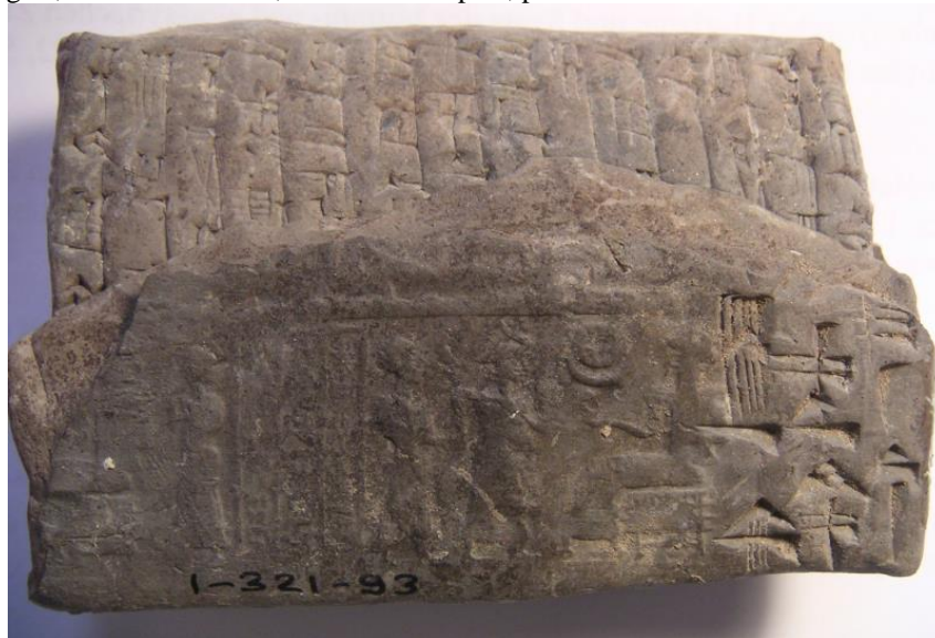
Fig. 7: Royal letter Kt 93/k 201+376+381 (8,4 × 5,3 cm, envelope 4,2 × 8,6)

The letters sent by the king of Aššur which transmit to the Kaneš Assyrian authorities a verdict of the City assembly constitute a special case: the king's cylinder seal is unrolled in a direction perpendicular to the text of the envelope (Fig. 7). 44