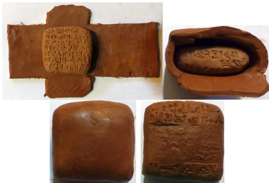
Fig. 14: The different steps in the manufacture of an envelope.

At last, before closing the envelope, it is necessary to leave a lot of free space between the tablet and the envelope, because during the drying process, the clay retracts a lot and thus can easily split or even break itself by retracting on the tablet. This explains why many envelope fragments have impressions of positive cuneiform signs, as the envelope by retracting took on the shape or even stuck to the tablet. Of the first envelopes made, one envelope out of two cracked after one day, and some even broke after two days. The envelope did not adhere to the tablet, and it was possible to make a replacement envelope after removing the remains of the broken envelope. If, when closing the envelope over the tablet there is too much free space, then it becomes very difficult to write on the envelope and to unroll the cylinder seals. It is therefore very important to find the best possible balance to adjust the clay envelope around the tablet.