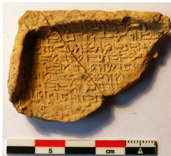
Fig. 8: Inside of the envelope Kt 93/k 865

The letters sent by the king of Aššur which transmit to the Kaneš Assyrian authorities a verdict of the City assembly constitute a special case: the king's cylinder seal is unrolled in a direction perpendicular to the text of the envelope (Fig. 7). 44