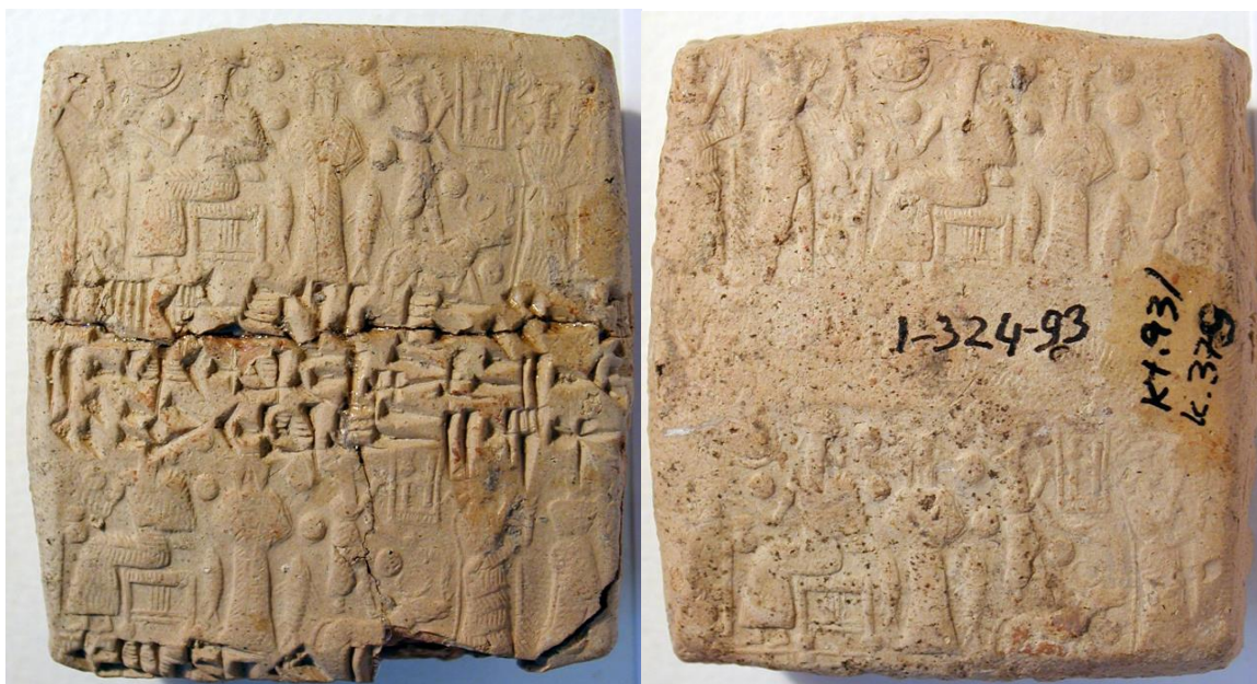
Fig. 2: Envelope of a letter from Ah-šalim to Ištar-bāni, Kurub-Ištar and Hattiya; Kt 93/k 379 (5 × 4,6 cm).

uninscribed. Thus, when we deal with a fragment of the reverse, it is very difficult to match it with its corresponding tablet.