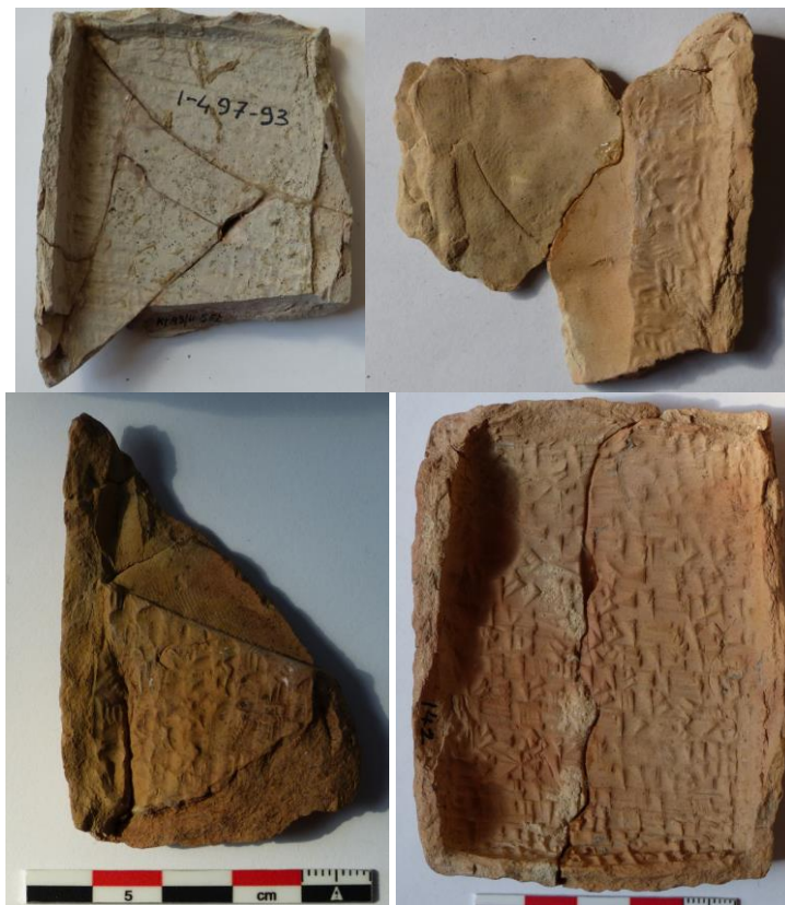
Fig 11: Insides of envelope fragments. Kt 93/k 552, Kt 93/k 228, Kt 93/k 117, Kt 93/k 142

Analyzing further the inner side of the envelopes, several observations can be made that give clues about how they were shaped. The envelope was made of a thin layer of clay folded around the tablet and over itself so that its both ends overlapped. The envelope was more or less thick, often thinner on the edges than on the obverse or on the reverse where the clay overlapped. Different layers of clay can be sometimes distinguished (Fig. 11). 46 Indeed, inside some of the envelope fragments, we observe a completely smooth part, suggesting that, either on the obverse or on the reverse, the layers of clay of the envelope superimposed allowing to close it. When broken, the superimposed layers have been occasionally detached leaving a more or less flat surface, along the zone with negative imprints of cuneiform signs (Fig. 11).