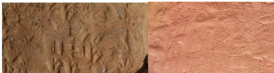
Fig. 12: textile and fibers imprints on the inside of envelopes Kt 93/k 373 Kt 93/k 223

In a unique case up to now, tiny pieces of a textile remained fossilized on the tablet Kt 94/k 487. This tablet looks brand new, as if just out of its envelope. No analyses have yet been carried on these textile remains. 49