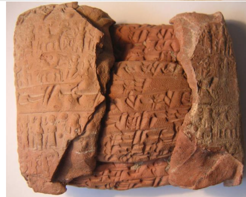
Fig. 10: inside of the envelope Kt 93/k 843 with the negative imprint of a “second page”; Kt 93/k 211: Tablet and “second page” preserved in their envelope; Kt 93/k 55+120+831+240: join between two envelope fragments, main tablet and “second page”.