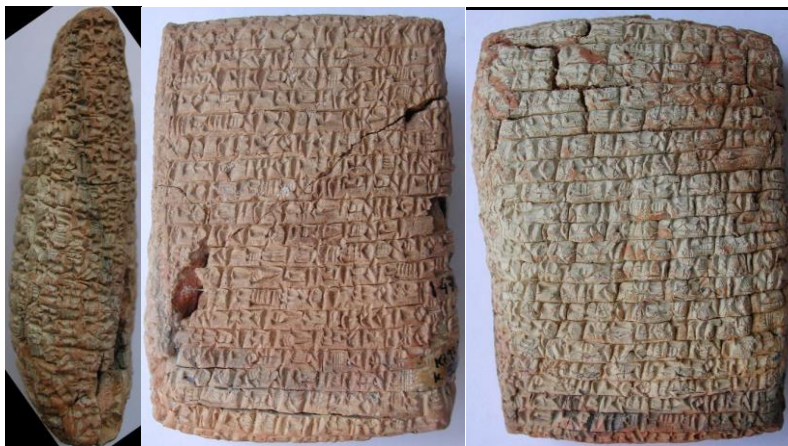
Fig. 1: Letter to Rabi-Aššur, Ataya, Puzur-Aššur, Šu-Ištar, Šamaš-abi, Anina, Amārum, and Tariša from Aššur-taklāku; Kt 93/k 526 (4,9x6,7 cm), left edge, obverse and reverse.

The Old Assyrian tablets are usually small in size, the average corresponding more or less to the palm of the hand. The writing is small and tight, which makes it possible to write a lot of text on a small surface. For example, several letters sent by Aššur-taklāku, the last owner of the ‘1993 archive’, are written with a very tiny script: Kt 93/k 526 measures 4,9 × 6,7 cm and has 53 lines (Fig. 1), including 7 lines on the left edge. 40 This small size facilitates the making of an envelope.