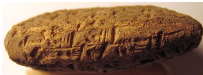
Fig. 13: Fossilized textile on the edge of a tablet, Kt 94/k 487

Thus, the practice of wrapping tablets in a thin textile before shaping the envelope must have been quite regular in the Old Assyrian period; this was necessary when the authors of letters or writers of legal texts could not wait for two days before enclosing their tablet in an envelope. A white powder, which could correspond to decomposed textile fibers, remained inside some uncleaned envelope fragments. 50