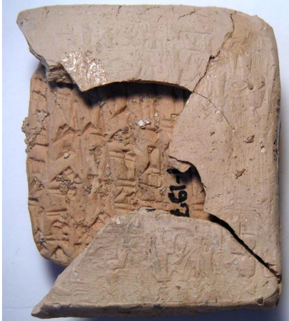
Fig. 9: Join between envelope fragments Kt 93/k 865Kt 93/k 232+136 + 220