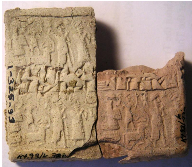
Fig. 5: Two seal impression of Tariša's seal on the envelope Kt 93/k 372+380 (5 x 4.8 cm)

On letter envelopes, the seal impression of the sender was repeated twice on the obverse, the few lines of text positioned with the same orientation in-between, and twice on the reverse (Fig. 5). It was also reproduced on all the edges. In the case of legal texts, the number of seal impressions on the obverse and the reverse depended on the number of witnesses and the length of the text to write.