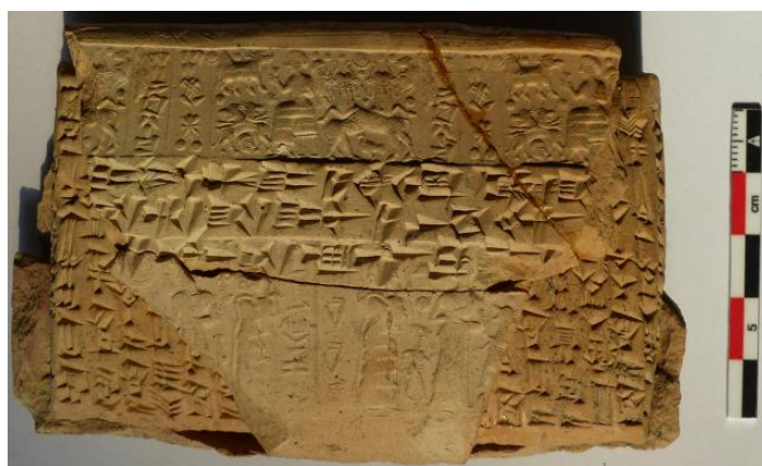
Fig 4c: Letter Kt 93/k 143 (env. 6,5 × 9,5 cm). The text on the envelope is written perpendicular to the one on the tablet.

The seals were usually first impressed on the envelope before the text was written; thus some wedges overlap regularly the feet or the heads of the figures of the seal's scene (Fig. 5).