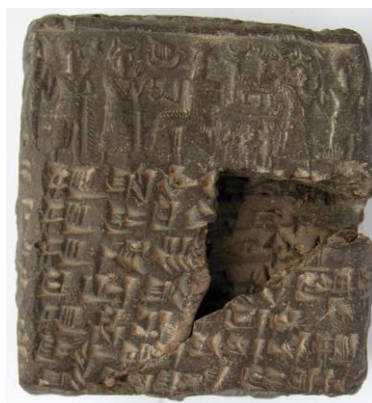
Fig. 4b: Contract, Kt 93/k 945 (5,3x5,7 cm). The text on the envelope is written parallel to the one on the tablet, but head to tail.

The seals were usually first impressed on the envelope before the text was written; thus some wedges overlap regularly the feet or the heads of the figures of the seal's scene (Fig. 5).