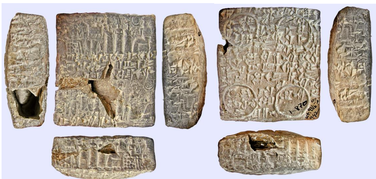
Fig. 3: Envelope of a loan contract belonging to Aššur-taklāku, the debtor is Kabašunuwa, son of Kēna-Aššur Kt 93/k 942 (4,6 × 5,1 cm).

For documents of legal value, the text is often repeated in its entirety on the envelope, so that one could read it without actually opening the envelope. The seal impressions on every side of the envelope belonged to the parties and witnesses. The persons who sealed the envelope are mentioned at the beginning of the text, on the obverse of the envelope, in the form 'kišib PN' with their fathers' names (Fig. 3). In general, on the envelope, one finds first the names of the witnesses followed by those primarily concerned by the contract, as for example the debtor for a loan contract.