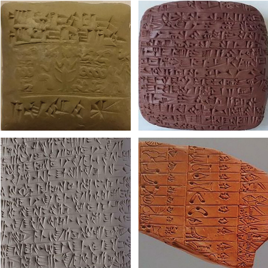
Fig. 8: Four modern replicas. A clay envelope and its tablet enclosed inside (upper left corner), and tablets produced by the author in experiments; © Cécile Michel.

Secondly, organising scribal schools that are open to a wide range of people helps scholars share their knowledge of cultural history and in some cases prevent ignorance from leading to the destruction of the cultural heritage of humanity. 66 Educational activities may also be channelled at the elite and rulers by creating honorary gifts for them containing original or specially written texts. In doing this, Assyriologists also show how much they value their own discipline, which