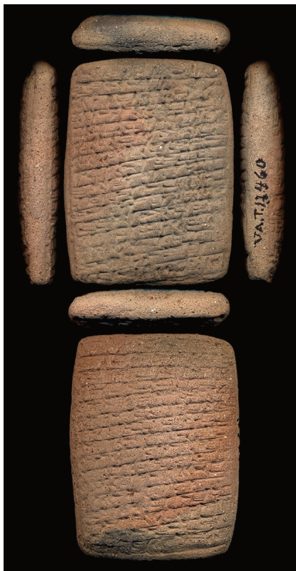
Fig. 5b: A fake Old Assyrian moulded tablet with erased edges; the Vorderasiatische Museum Berlin, VAT 13460 (Michel 2003, 32); © Photo CDLI, P358324, < https://cdli.ucla.edu/dl/photo/P358324.jpg >.

The letter written by Jules Oppert confirms the active manufacture of forged cuneiform tablets in the late nineteenth century CE. In fact, this massive production of cuneiform fakes went on for several decades, at least up to the 1930s. Oppert's answer to Maspero also shows the difficulty that specialists face when they have to produce an expert report on an artefact. The collections of Old Assyrian tablets in museums and private hands in Europe and North America