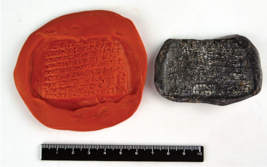
Fig. 6: A lead mould from the late nineteenth or early twentieth century CE (on the right) and its imprint (on the left).

The heavy object was a broken lead mould which was clearly used to make one side of an Old Assyrian clay tablet; 56 this half-mould is now kept at Çorum Museum. Physical analyses were made to determine the age of the object. The ensuing report defined it as ‘ancient’, but did not say exactly how ancient it was. The most likely hypothesis is that the artefact actually dates to the end of the Ottoman Empire, presumably the late nineteenth or early twentieth century. The text on this half-mould does not match the one on the tablet which has so many fake duplicates, so several other moulds of original tablets must have been prepared. It is quite unique to have found the tool which was used to produce such fakes more than a century ago.