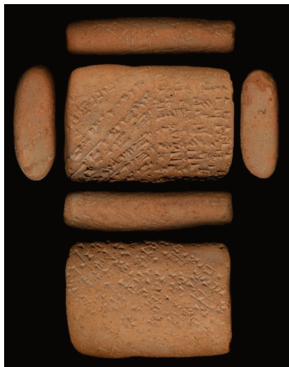
Fig. 5a: A fake handwritten tablet with diagonal lines; the Monserrat Museum (Márquez Rowe 2006, no. 2); © Photo CDLI, P432801, < https://cdli.ucla.edu/dl/photo/P432801.jpg >.

Akkadian in order to correspond with all the kings of the Near East since they were the diplomatic language and script of the time.