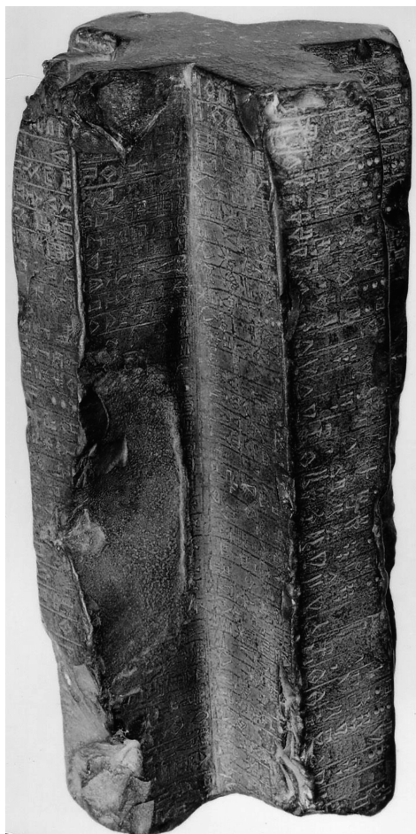
Fig. 1: Cruciform stone monument; 346 lines of archaic writing are inscribed altogether: statements of grants and privileges bestowed on the Šamaš Temple by the Akkadian king Maništušu (2269 BCE–2255 BCE). London, British Museum (acquired in 1881); ©Trustees of the British Museum (CC BY-NC-SA 4.0).

by King Nabonidus. 19 The inscription purports to be from the time of the Akkadian king Maništušu, however, whose reign dates to the twenty-third century BCE.