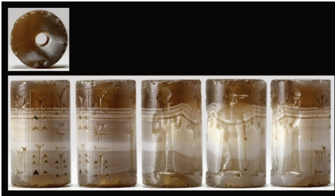
Fig. 7: A fake inscribed cylinder seal made of stone; the Walter Art Museum, Baltimore; © Photo CDLI P272884, < https://cdli.ucla.edu/dl/photo/P272884.jpg >.

The production of fakes of Mesopotamian antiquities was so widespread that it inspired the nineteenth-century Assyriologist Joachim Menant to write a book about the subject. 62 However, all the examples that he mentions were made of stone, a type of production that required completely different techniques to be used. It seems that fake cuneiform artefacts carved in stone were also produced in great quantities by counterfeiters who were very imaginative, and highly skilled as well in some instances, even creating new types of inscribed monuments. 63 Cylinder seals carved in semi-precious stones with miniature scenes and sometimes a short cuneiform inscription were also produced in large quantities, presumably because they were highly valued on the antique market (Fig. 7).