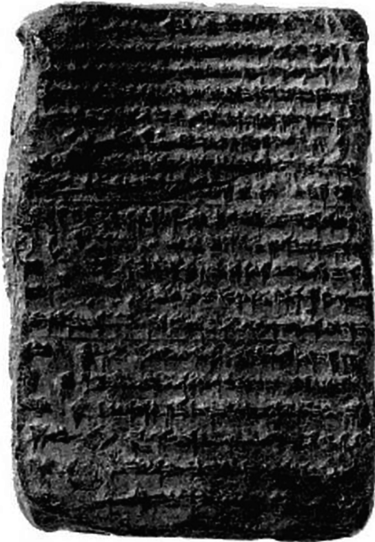
Fig. 4: A fake tablet in a positive imprint, part of the collection of Claudius Rich, British Museum. Jones 1990, no. 169b.

linked to scholars' growing interest in this mysterious writing in the general context of a new fascination about antiquities serving as witnesses of the past.