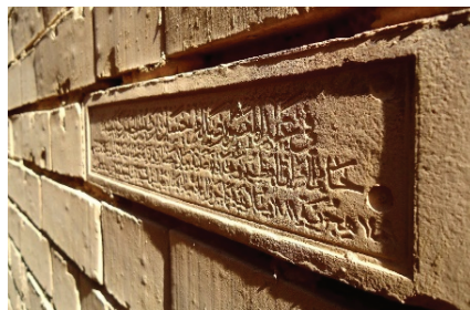
Fig. 2b: Stamped brick on a processional street wall in Babylon bearing the name of Saddam Hussein; © Osama Shukir Muhammed Amin FRCP (Glasg) / CC BY-SA, < https://commons.wikimedia.org/wiki/File:Stamped_brick_at_the_ancient_city_of_Babylon_bearing_the_name_of_Saddam_Hussein.jpg >.