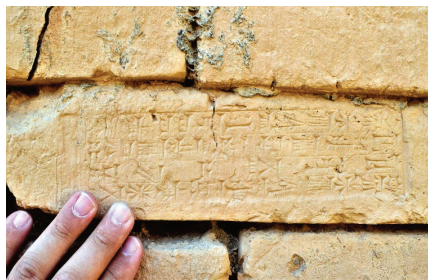
Fig. 2a: Stamped mud-brick bearing the name of Nebuchadnezzar; © Osama Shukir Muhammed Amin FRCP (Glasg) / CC BY-SA, < https://commons.wikimedia.org/wiki/File:Stamped_mudbrick_with_a_cuneiform_text,_procession_street,_Babylon,_Iraq.jpg >.

Nebuchadnezzar with his name in the walls which he ordered the construction (Fig. 2a). As the Elamite king, he was searching for personal glorification by raising himself to the level of an illustrious predecessor. The ‘restoration work’ that Saddam Hussein ordered to be done was nothing other than a (re)construction of the past.