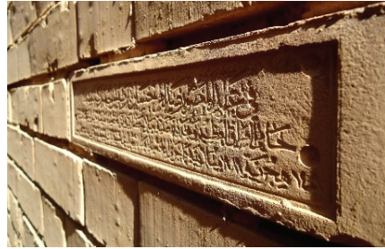
Fig. 2b: Stamped brick on a processional street wall in Babylon bearing the name of Saddam Hussein; © Osama Shukir Muhammed Amin FRCP (Glasg) / CC BY-SA, < https://commons.wikimedia.org/wiki/File:Stamped_brick_at_the_ancient_city_of_Babylon_bearing_the_name_of_Saddam_Hussein.jpg >.