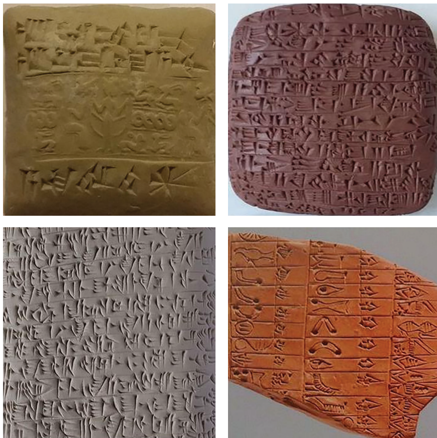
Fig. 8: Four modern replicas. A clay envelope and its tablet enclosed inside (upper left corner), and tablets produced by the author in experiments; © Cécile Michel.

Secondly, organising scribal schools that are open to a wide range of people helps scholars share their knowledge of cultural history and in some cases prevent ignorance from leading to the destruction of the cultural heritage of humanity. 66 Educational activities may also be channelled at the elite and rulers by creating honorary gifts for them containing original or specially written texts. In doing this, Assyriologists also show how much they value their own discipline, which