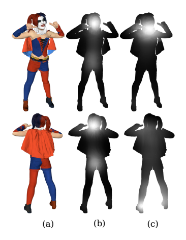
Fig. 3. Illustration of 6 partial point clouds, each line represents: (a) the rendered view, (b) the ground-truth saliency information and (c) the resulted saliency based on interpolation technique.

relevant. In fact, interpolation results depend on the used 2D saliency model to generate different saliency maps view offline. For this reason, we should evaluate different saliency models and consider the most-performing one once applied on computer-generated contents. We could also, if enough data are available, fine-tune the 2D computational model on ad-hoc contents. In figure 3, we show an example that illustrates irrelevant saliency information. Since the 2D saliency model was trained on natural images, people in the photos look to the camera, therefore the prediction resulting from our approach (cf. fig. 3 first row, column (c)) is coherent with the ground truth (cf. fig. 3 first row, column (b)); as the character face is visible (cf. fig.3 first row, column (a)). Whereas, the second row in figure 3 shows a mismatch between the predicted result and the ground truth. The reason behind this irrelevance is that saliency information obtained from neighbor views indicate that the feet are salient (which is not coherent with the ground-truth).