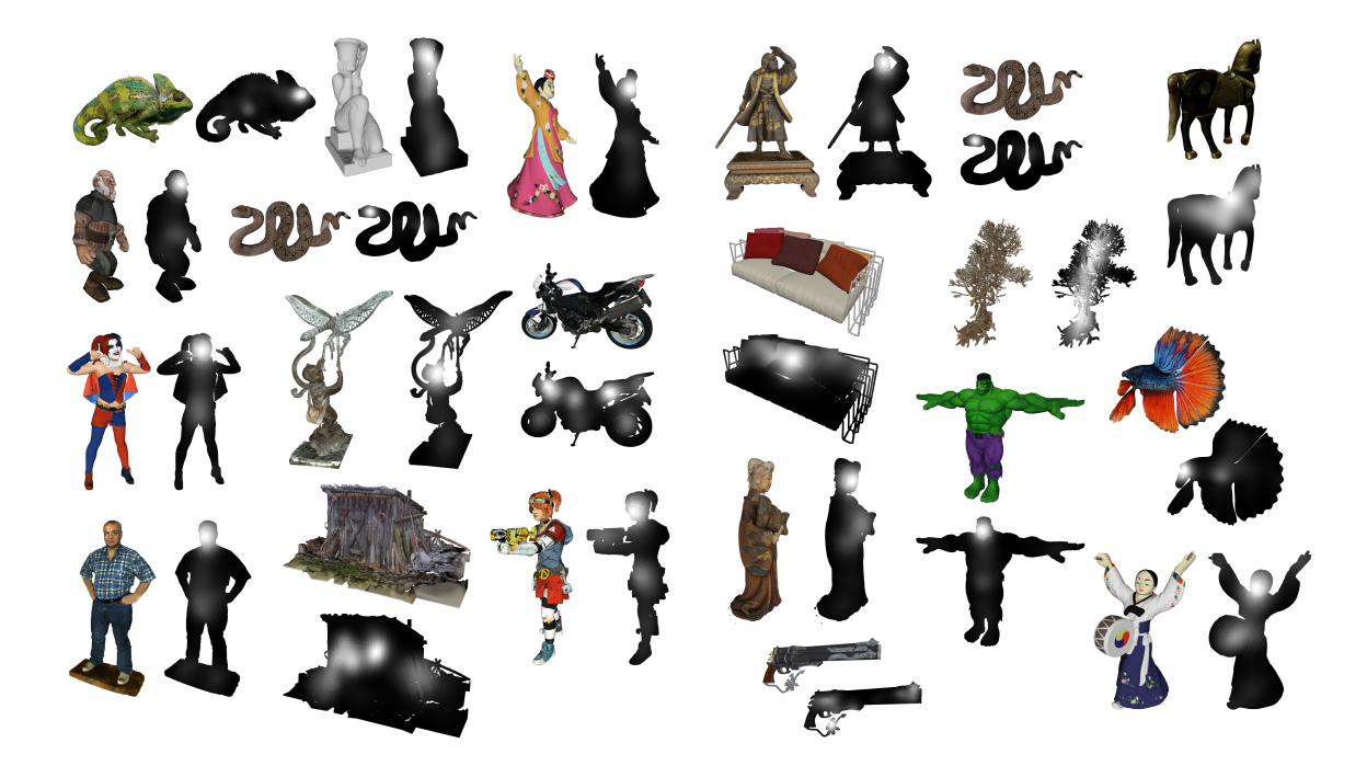
Fig. 2. Illustration of one view of the 3D graphic contents and its corresponding saliency collected from human fixations; also called saliency ground-truth.

related to the viewpoint from which the content is rendered (i.e. perceived by the observer). In fact, the database obtained by [11] is a pseudo-ground truth because observers were asked to select important points that could be chosen by others, during the experiment. This takes the form of a task provided to the observer influencing the detection of saliency because everyone has a different definition of what it means to be perceptually important. In this paper, we build a groundtruth that is viewpoint-aware by conducting a psycho-visual eye-tracking experiment in order to effectively validate our approach.