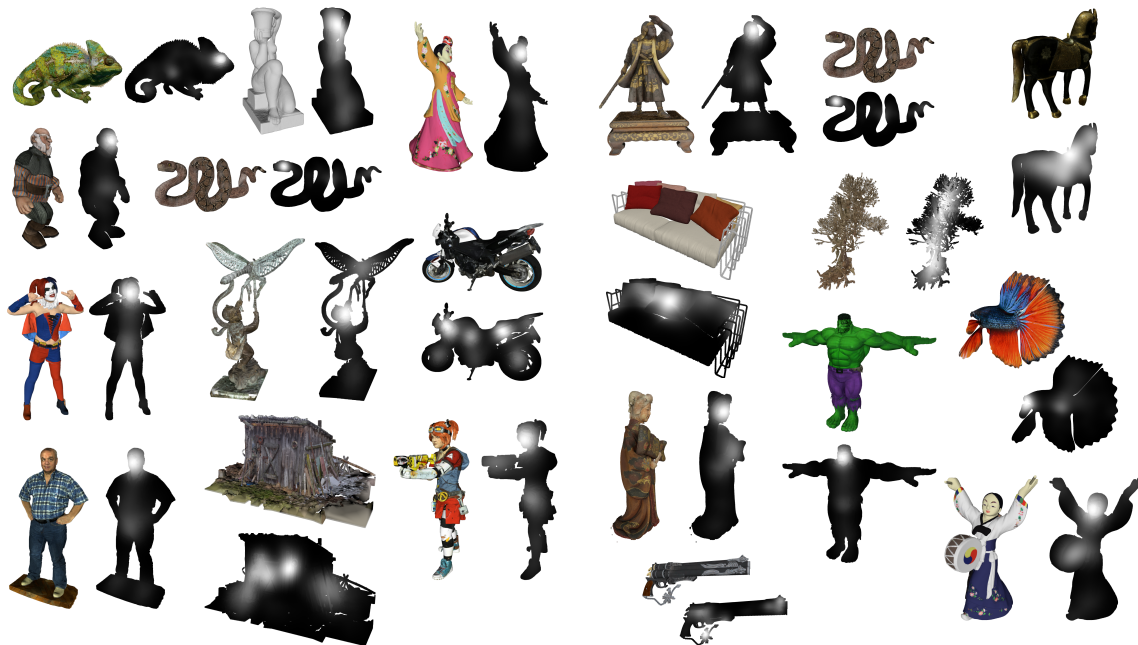
Fig. 2. Illustration of one view of the 3D graphic contents and its corresponding saliency collected from human fixations; also called saliency ground-truth.

related to the viewpoint from which the content is rendered (i.e. perceived by the observer). In fact, the database obtained by [11] is a pseudo-ground truth because observers were asked to select important points that could be chosen by others, during the experiment. This takes the form of a task provided to the observer influencing the detection of saliency because everyone has a different definition of what it means to be perceptually important. In this paper, we build a ground-truth that is viewpoint-aware by conducting a psycho-visual eye-tracking experiment in order to effectively validate our approach.