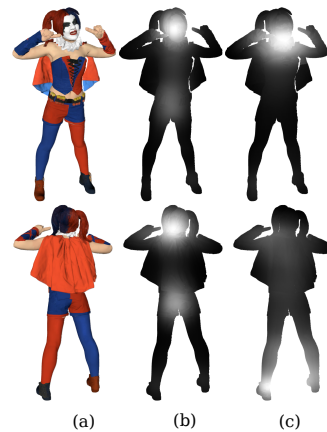
Fig. 3. Illustration of 6 partial point clouds, each line represents: (a) the rendered view, (b) the ground-truth saliency information and (c) the resulted saliency based on interpolation technique.

relevant. In fact, interpolation results depend on the used 2D saliency model to generate different saliency maps view of-line. For this reason, we should evaluate different saliency models and consider the most-performing one once applied on computer-generated contents. We could also, if enough data are available, fine-tune the 2D computational model on ad-hoc contents. In figure 3, we show an example that illustrates irrelevant saliency information. Since the 2D saliency model was trained on natural images, people in the photos look to the camera, therefore the prediction resulting from our approach (cf. fig. 3 first row, column (c)) is coherent with the ground truth (cf. fig. 3 first row, column (b)); as the character face is visible (cf. fig.3 first row, column (a)). Whereas, the second row in figure 3 shows a mismatch between the predicted result and the ground truth. The reason behind this irrelevance is that saliency information obtained from neighbor views indicate that the feet are salient (which is not coherent with the ground-truth).