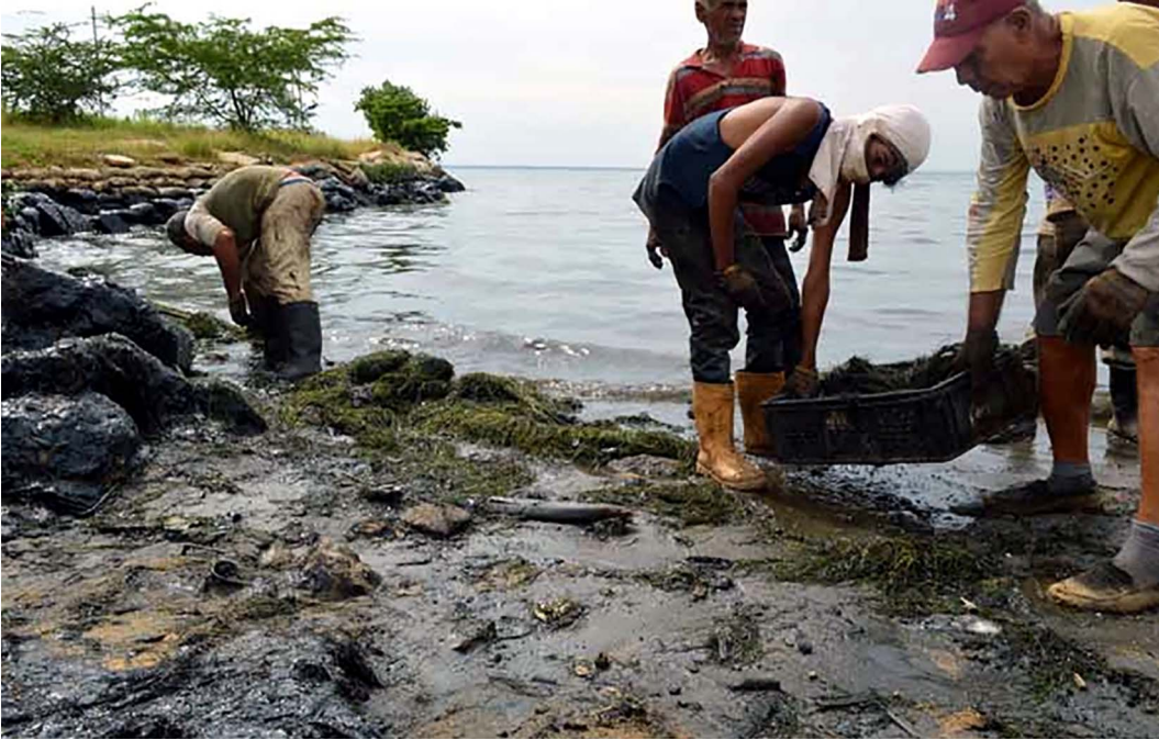
Figure 6: Fishermen landing fish on the shore of Lake Maracaibo (Venezuela) in 2015 (© Vitalis NPO). Reprinted with permission.

Consequently, water degradation reaches a point at which excessive organic inputs to the aquatic system, even when associated with noticeable and damaging changes, cannot be captured and are lost in global pollution. The coastal lake of Maracaibo, Venezuela, is an example of such a silent configuration (Conde and Rodriguez 1999). Overall, riverine communities that depend on fishing struggle with blue-green microalgal blooms, chronic proliferation of aquatic duckweed ( Lemna spp.), and massive oil spills from pipelines and an extractive industrial complex nearby. Fishermen, most from indigenous communities such as the Anu, are the first victims of green-black lake pollution (Figure 6). Despite desperate efforts of local NGOs and concerned scientists from diverse backgrounds, no organized research (whether in ecology or, even less probable, social sciences) or advocacy campaign can be performed in the current political context there, and the only academic sources available on the phenomenon adopt a biotechnical perspective.