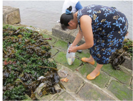
Figure 5: Women harvesting and selling algae on the urban shoreline of Qingdao (Shandong, China) in 2011. Reprinted with permission from Levain (2017).

Indeed, in most documented cases, management of nutrient pollution was first dominated by health concerns and focused on specific areas and sensitive points (e.g., water supply sources and watersheds) and only rarely on strategic relocation or extension of wastewater discharge to lakes or seashores. Management strategies were concerned mainly with protecting human health and fisheries (Laakkonen and Laurila 2007). In addition, since water pollution management was governed by social perception of the feasibility and practicability of solutions, abatement strategies focused on biotechnical control of the water cycle. This kind of socio-technical system leaves the ocean separate, as an unmanageable place, until more holistic conceptual-