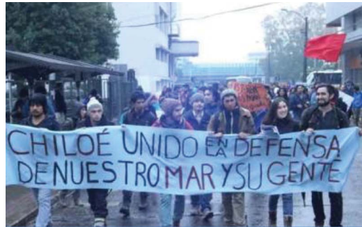
Figure 7: Protest following a massive red tide episode in Chiloé, Chile, in 2016 (© PienSAChile.com/T.Tricot). Reprinted with permission.

In a liberal and specialized economy, nonpoint-source pollution associated with global change is a factor of diffuse antagonisms and social tensions in coastal areas. The literature relates two main processes by which these stalemates may be overcome and by which people's experience regains visibility through grassroots movements. The first has been observed in industrial aquaculture areas such as the coast of Chile. Aldo Mascareño et al. (2018) show, for instance, how a red tide crisis serves as both an indicator of social-ecosystem vulnerability and as an ordeal, which can eventually give rise to organized social movements such as public protests by workers in fisheries and aquaculture (Figure 7). The second process is the development of popular epidemiology (Brown 1987), associated with health risks of micro- and macroalgal blooms, which eventually leads to recognition of human victims and to emergence of community science, like those for green tides in Brittany since 2009 (Levain 2014).