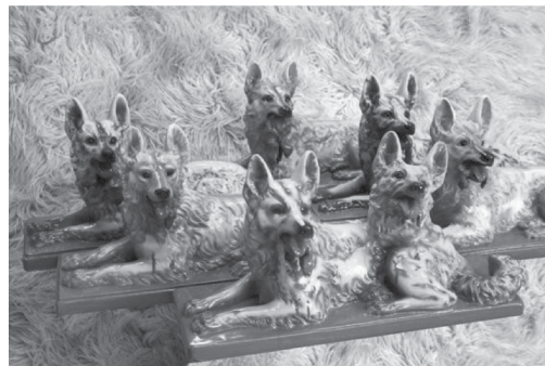
Figure 4: Dogs drooling green algae. Plastic figures by Xavier Théffo (2010) (© Xavier Théffo). Reprinted with permission.