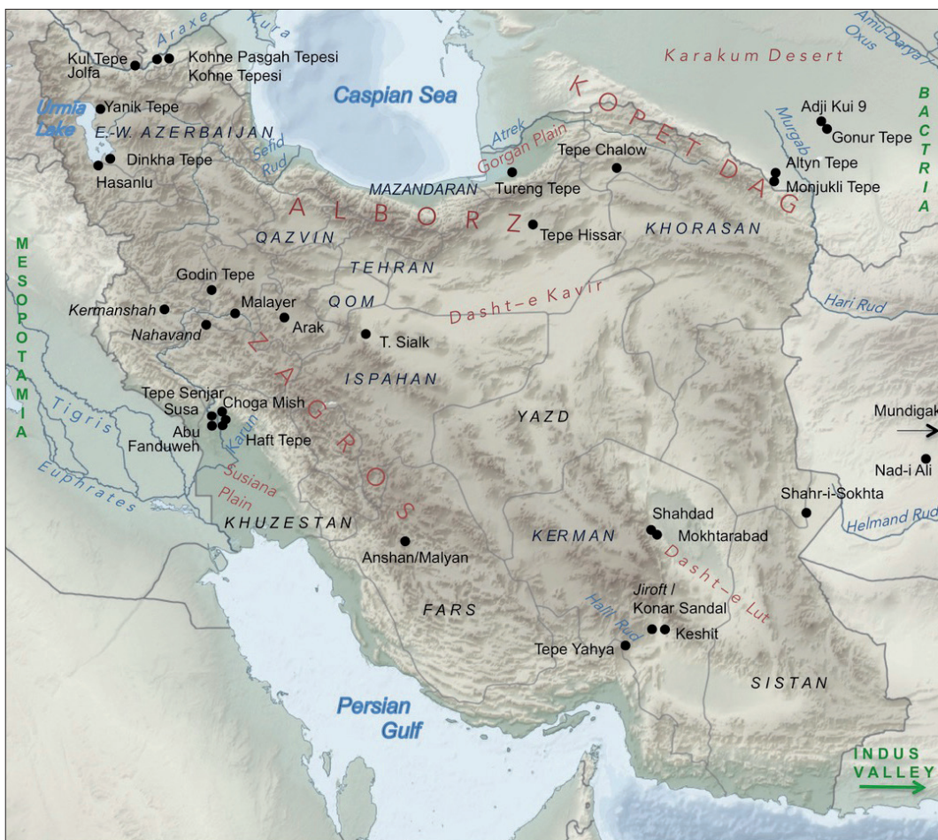
Fig. 1 – Location of archaeological sites and principal regions in Iran and adjacent areas quoted in the text; Archaeological site in plain black, modern cities in italic, modern provinces in black italic capital letters, ancient civilisations in green, mountains in capital red, plains and deserts in plain red.