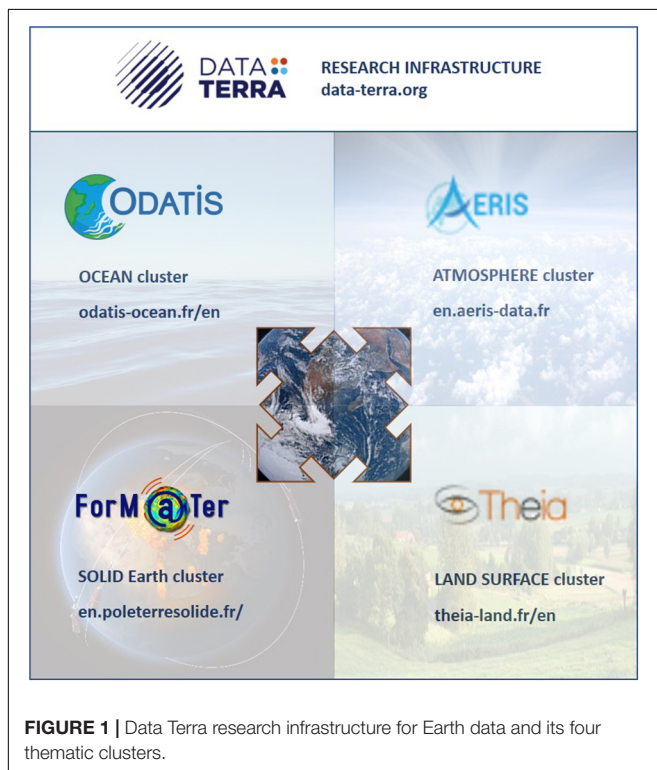
FIGURE 1 | Data Terra research infrastructure for Earth data and its four thematic clusters.

Terra also serves the international community through satellite missions, international monitoring networks, and partnerships for development.