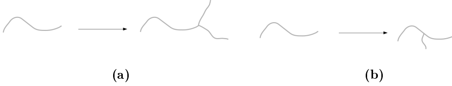
Figure 2: (a) Apical branching. An open segment branches into two new filaments at its end. The open end of the segment therefore closes (and the segment becomes “closed” itself) and two open segments, initially of length 0, are created and start growing in length. (b) Lateral branching. A new open segment of initial length zero branches off from an existing segment, which can be open or closed, at a location which is uniformly distributed along the current length of the existing segment. This branching event fragments the existing length into 2 segments (one necessarily closed, and one of the same type as the fragmented segment), and adds a third segment which is open and initially of length zero.

Let us fix v, b_1, b_2 \in (\mathbb{R}_+^*)^3 . The dynamics of the process (\mathcal{Z}_t)_{t \geq 0} are as follows: