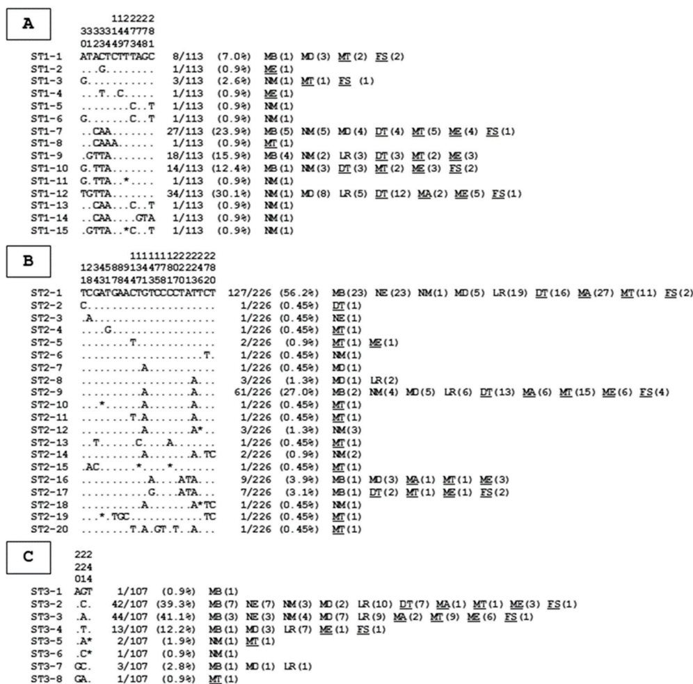
Figure 2. Alignment of partial SSU rDNA gene sequences from Blastocystis sp. ST1 (A), ST2 (B), and ST3 (C) isolates. Only the variable positions identified in the compared domain of the gene for these STs are shown in this alignment. The positions of variable nucleotides with respect to the reference sequences (genotypes ST1-1, ST2-1, and ST3-1) are indicated above the alignment (vertical numbering). Nucleotides identical to those of the reference sequences are represented by dashes and gaps are represented by asterisks. All the genotypes identified for each ST are indicated on the left of the alignment. On the right of the alignment is reported the total number and percentage of isolates identified in our study for each genotype followed by their repartition per village (number of isolates in parentheses). Abbreviations: MB, Mbakhana; MD, Maka Diama; NM, Ndiol Maure; LR, Lampsar; NE, Ndiawdoune; MT, Malla Tack; FS, Foss; ME, Mbane; DT, Diokhor Tack; MA, Malla. The abbreviations of the villages located in the area of Lake Guiers are underlined, which is not the case of those located in the area of Saint-Louis.

All the partial SSU rDNA gene sequences representative of the same ST were aligned with each other to assess intra-ST diversity. The 113 ST1 sequences showed 97.2% to 100% identity between them. By comparing all these ST1 sequences, 12 positions were reported as variable, i.e., positions exhibiting at least one nucleotide difference within at least one of the compared sequences (Figure 2), allowing the identification of 15 so-called genotypes (ST1-1–ST1-15).