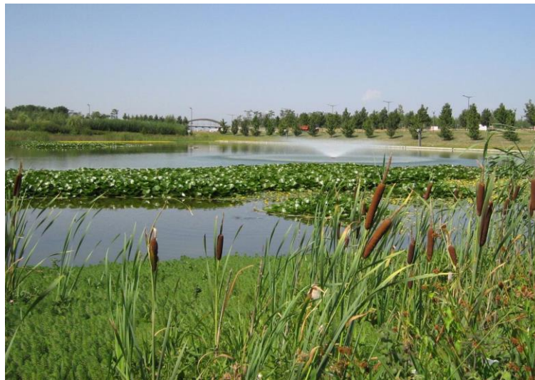
Figure 3: Stormwater ponds in the Porte des Alpes business district in Lyon, France.