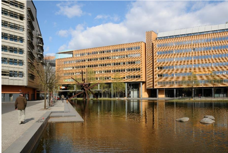
Figure 2: Potsdamer Platz in Berlin, Germany. Architects: Renzo Piano and Christoph Kohlbecker, stormwater management: Atelier Dreiseitl.