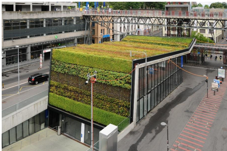
Figure 4: Vegetated roof and walls of the Flon metro station in Lausanne, Switzerland. Architects: Bernard Tschumi Architects and Merlini & Ventura, vegetation: Canevaflor.

Initially a landscape technique, green roofs are now considered as true facilities for stormwater management, with retention and evapotranspiration optimised to reach the “zero-discharge” objective for all non-exceptional storm events (e.g. Bertrand-Krajewski and Herrero, 2017; Shafique et al. , 2018). Rainwater harvesting (Han and Mun, 2011) and storage allows watering raingardens, urban gardens, and farms (permaculture). Architecture becomes green (Figure 4) and explicitly accounts for stormwater in the design of roofs, façades, water resources and energy savings. Green roofs and green walls also contribute to enhance biodiversity in cities (Madre et al. , 2014; Mayrand and Clergeau, 2018).