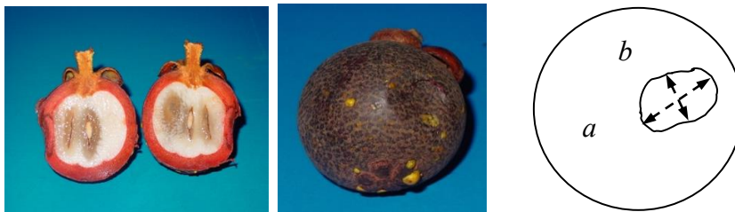
Figure 1: The mangosteen bruising and the bruising diameter of mangosteen, a: the maximum fruit diameter, and b: the minimum fruit diameter

Where BD = bruising diameter (cm.) a = maximum fruit diameter (cm.) b = minimum fruit diameter (cm.) ND = the number of fruit damage at BD > 0.5 cm. NF = the total tested fruit