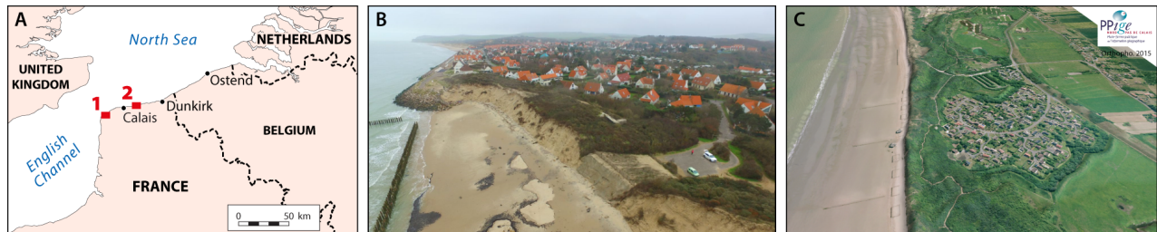
Figure 1. (A) Location of the studied sites : 1: Wissant, 2: Oye-Plage; (B) Photograph of the housing estate threatened by coastal erosion in Wissant; (C) Oblique aerial view of the housing estate at Oye-Plage protected from marine flooding by an eroding coastal dune.

risk perception and preferred strategies for facing future coastal hazards associated with climate change.