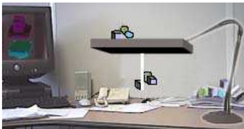
Figure 3: Our idea of ESKUA.

ESKUA (figure 3) is a TUI which increase the ease of assembling and handling a combination of parts. ESKUA means "the hand" in Euskara, the Basque Language, and is the french acronym of "Exprimentation d'un Système Kinésique Utilisable pour l'Assemblage".