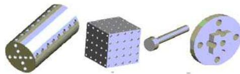
Figure 4: Samples of interacteurs : cylinder, parallelepiped, screw, graft.

We use the term "interacteur" to define our artifacts. We choose this term because an interacteur is an object to do interaction (inter + to act on). Afterward, to describe our artifact we use the term interacteur . ESKUA is composed of interacteurs, a video capture system and work area. The actions which the user carries out on interacteurs (displacement, combination and rotation) are reproduced in 3D on the display screen. The capture of the position and the orientation of the set of artifact is based on a system of video capture. Its low cost and its upgrading capabilities (a number of cameras, the liberty for the choice of interacteur forms, identification with colors) seem to us very interesting assets.