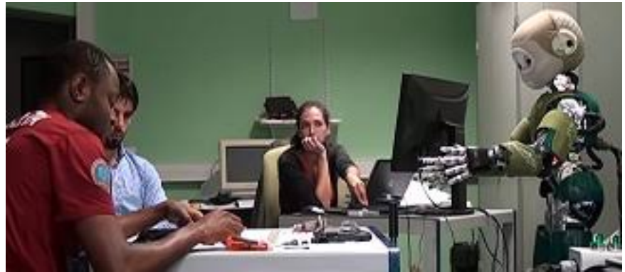
Figure 1: Sample situations combining speech and deictic gestures while monitoring attendance's attention. Left: face-to-face "Put That There" task [11]. Right: robot instructing two students how to re-mount a jigsaw tool [2].